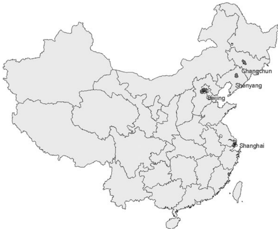
Figure 1. Locations of the urban districts of the four cities in China.