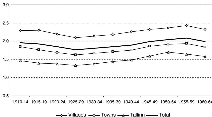
Figure 1. Cohort fertility of native population by type of current settlement in 2000.

The fertility of internal migrants in Estonia has not been studied, nor is much known about regional variation in fertility levels and urban–rural differences. In this context, a follow-up of the recent census (2000) data on the Estonian native population is highly informative. We see significant differences that exist in fertility levels of population across settlement hierarchy (Figure 1). Fertility in rural areas is clearly above replacement levels in all birth cohorts who have already passed, or are about to reach the end of their childbearing ages. Fertility in the urban population, however, remains below replacement level, comprising about 80% and 65% of rural levels in towns and the capital city of Tallinn, respectively (a very similar picture also applies for the immigrant population). It is also striking that fertility differences are rather stable, and do not change much across the cohorts, as one might assume.