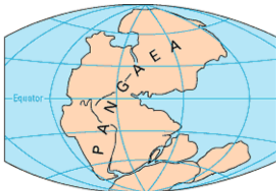
PERMIAN 225 million years ago