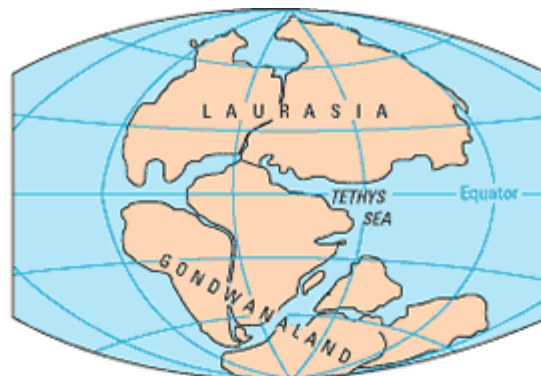
TRIASSIC 200 million years ago