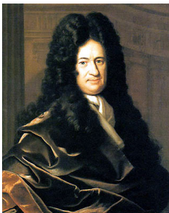
Gottfried Wilhelm von Leibniz (1646–1716) in Hannover

Solution to Quiz: At that time two major mathematicians emerged: