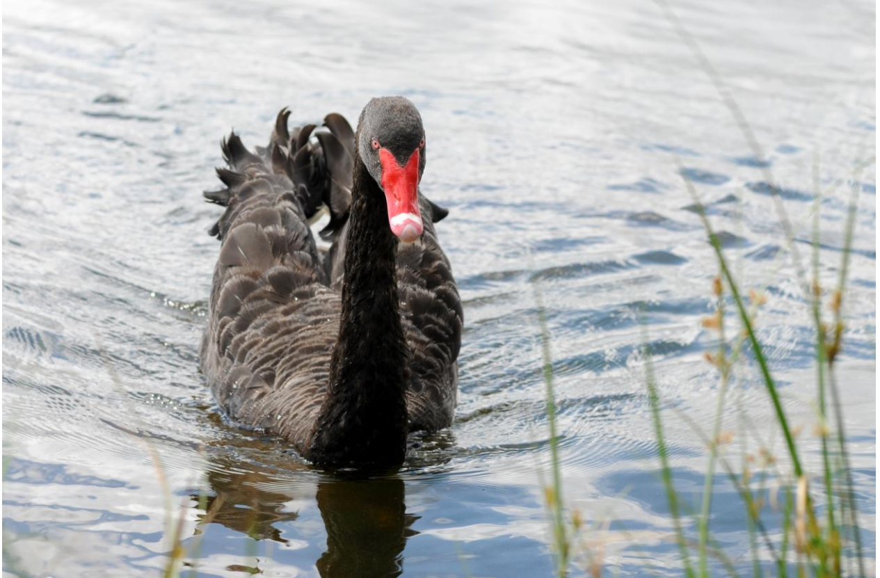
Fig. 5.1 A black swan in Perth (Western Australia).