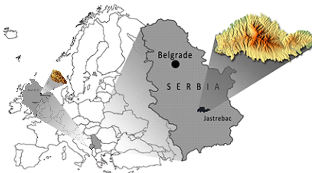
FIGURE 1 Geological location of researched sites

Statistical analysis. First, the transformation estimates of abundance and coverage for each species within the phytocoenological relevés were performed by the Van Der Maarel method [13]. CCA analysis of ecological-vegetation data was performed with the help of statistical software CANOCO 4.5 [14]. Monte Carlo permutation test was used to determine the significance of worth (eigenvalue) with appropriate CCA axes. The study calculated 499 randomly selected permutation of the described communities. Syntax names were given according to [15].