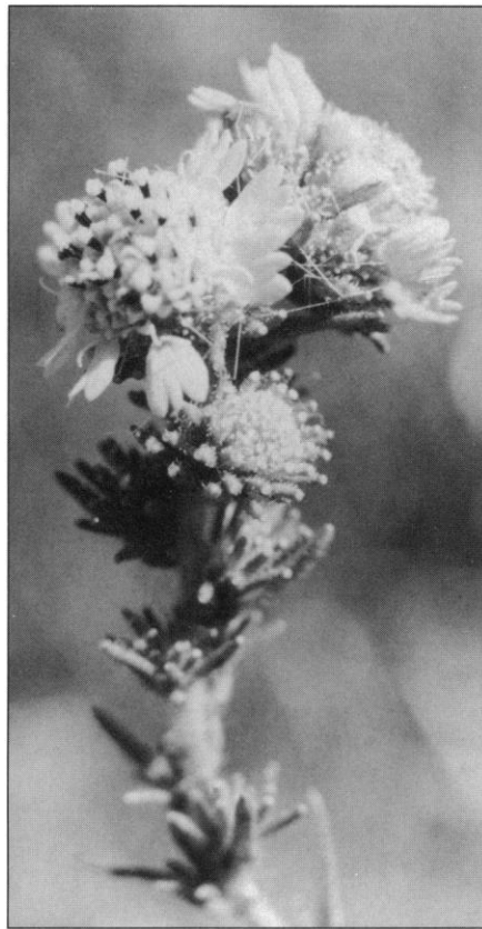
The Santa Cruz tarplant is one of the cautionary tales of plant reintroduction. After successful translocation of many plants, many of the transplants died unexpectedly.

Among mitigation successes so far is the reintroduction of running buffalo clover, Trifolium stoloniferum , to some of its native habitat in Missouri. The white-flowering clover with creeping stems once flourished from West Virginia to Kansas in the moist, shaded habitats along streams