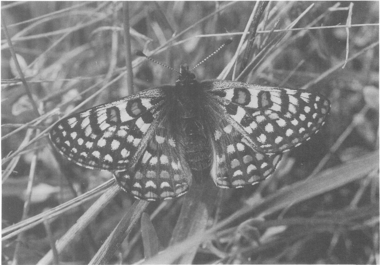
Figure 3. Newly emerged Euphydryas editha bayensis female in the area H serpentine grassland of the Jasper Ridge Biological Preserve.

in Euphydryas (Ehrlich & White 1980) and in Chlosyne , a genus closely related to Euphydryas (Schrier et al. 1976). Males travel relatively long distances to sip from moist earth around puddles, presumably to obtain sodium (Arms et al. 1974, Adler & Pearson 1982). The presence of both nectar and standing water, additionally, have been shown to be determinants of overall butterfly species numbers in Great Basin riparian communities (Murphy & Wilcox 1986).