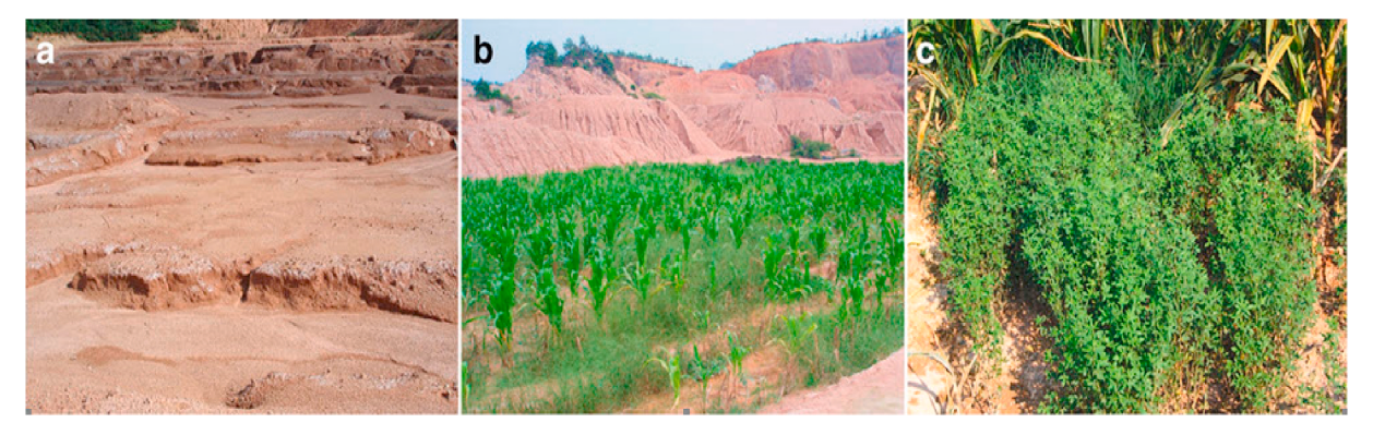
Fig. 5. Restoration stages of rare earth mine at Heping county in China; (a) Original mined land, (b) the land with ecological restoration for 2 years, and (c) the land with ecological restoration for 5 years.

phosphogypsum led to an increased immobilization of four heavy metals (zinc, nickel, lead, and cadmium) than when phosphogypsum was combined with rice straw composites. However, a later investigation revealed that the phosphogypsum combined with rice straw composites treated soils significantly improved canola's biomass production. Also, Seth (2012) observed that fungi altered root exudates' composition and the soil's pH. This modified and enhanced the heavy metal bioavailability and their uptake by the plants. Some microorganisms, such as bacteria that promote plant growth and mycorrhizal fungi influence heavy metal availability and uptake at the rhizosphere. These bacteria have proven to lessen the toxicity of heavy metals (Chen et al., 2015; Rajkumar et al., 2012).