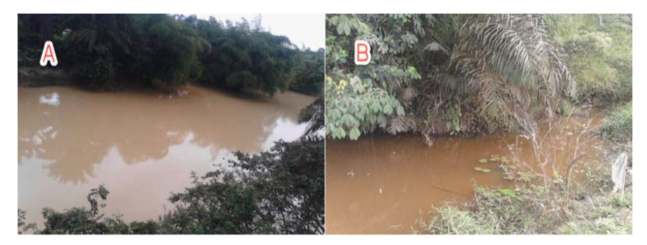
Fig. 4. Pollution of two different rivers (river Ankobra, left and River Aseesre, right) in Ghana by illegal small-scale mining activities. [Reproduced with permission from Mensah et al. (2015)].