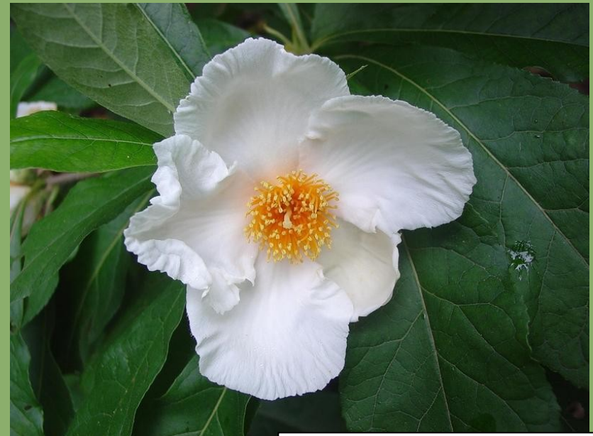
Franklinia alatahama