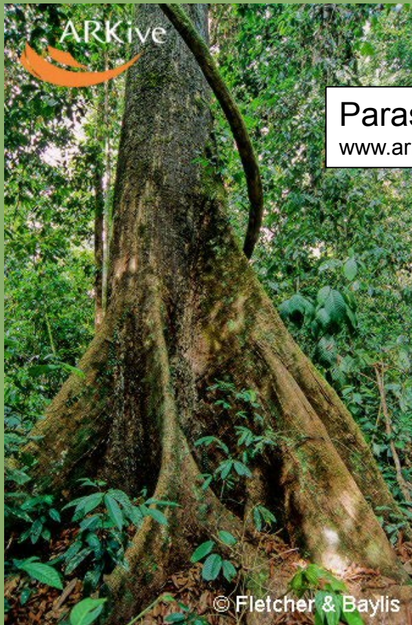
Parashorea macrophylla