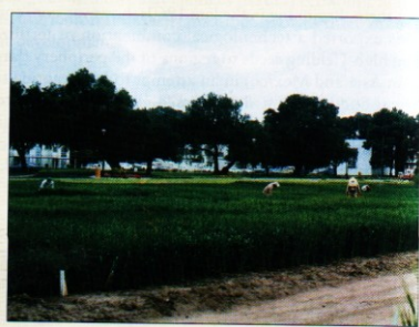
Figure 8.E Green revolution experimental plots The CIMMYT includes numerous plots for breeding and testing seed varieties.