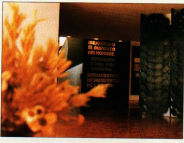
Figure 8.D The CIYMMT headquarters The Centre International de Mejoramiento de Maiz yTrigo (CIMMYT) (International Center for the Improvement of Maize and Wheat) in Texcoco, Mexico, is involved in plant breeding and research. High-yield-variety seeds were developed here for the Green Revolution. The center holds the world's premiere collection of corn and wheat germplasm. Modern, refrigerated storage vaults store many thousands or" varieties. Today, in addition to the static, cold storage, scientists are working with farmers to preserve seeds dynamically.