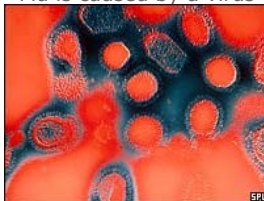
Flu is caused by a virus

9. Do you know some ways of preventing various diseases? Note them down.