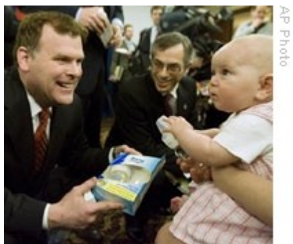
Canadian Environment Minister John Baird, left, and Health Minister Tony Clement hand out baby bottles that are free of BPA. In April, Mister Clement announced Canada's plans to limit use of the chemical.