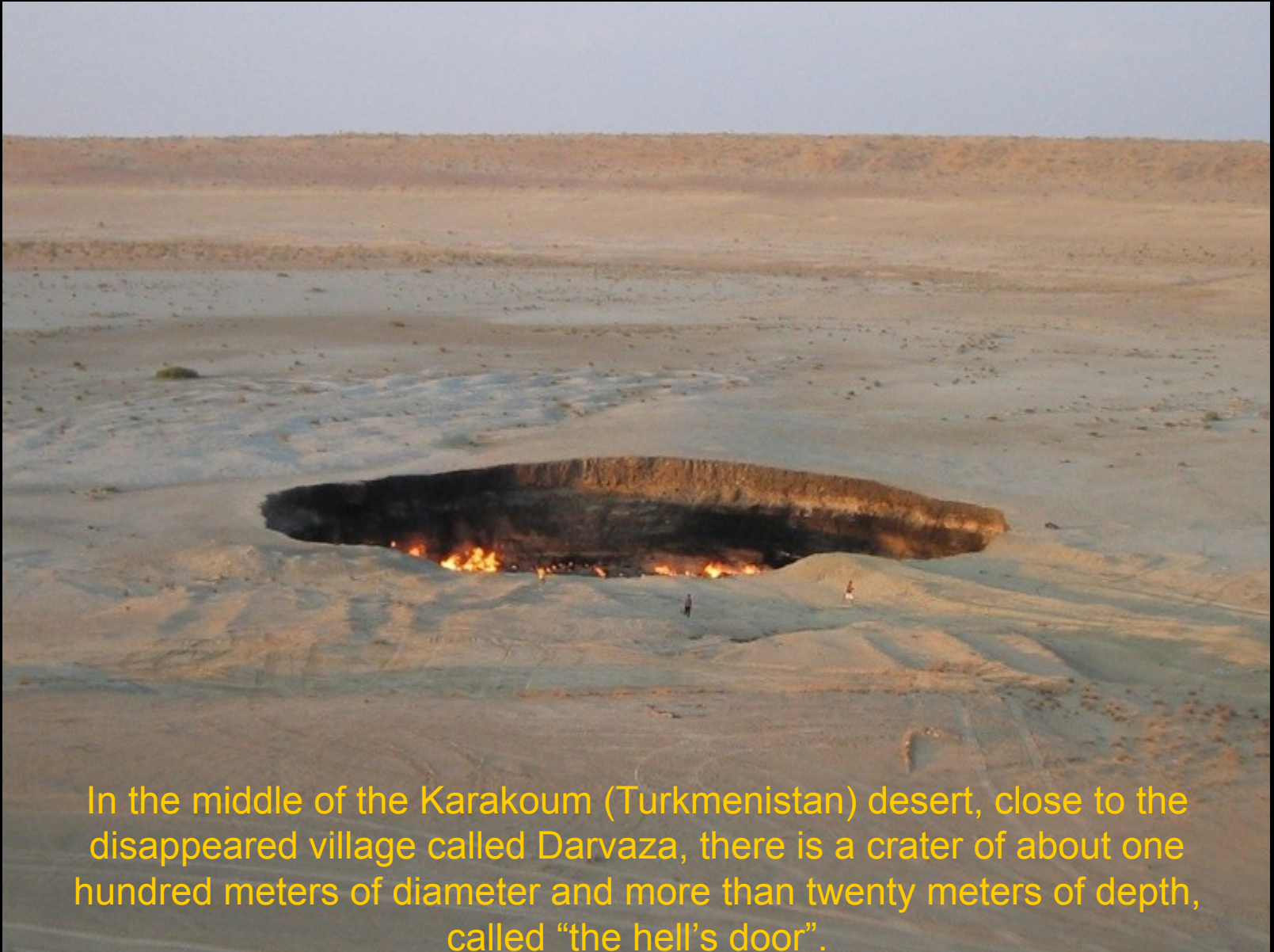
In the middle of the Karakoum (Turkmenistan) desert, close to the disappeared village called Darvaza, there is a crater of about one hundred meters of diameter and more than twenty meters of depth, called “the hell’s door”.