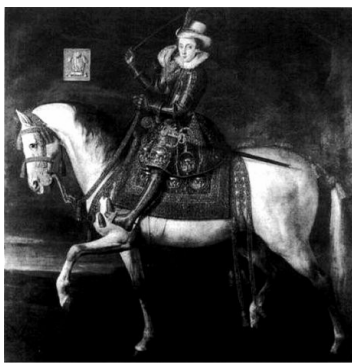
FIGURE 1. ROBERT PEAKE THE ELDER: HENRY PRINCE OF WALES ON HORSEBACK, C. 1610-12, BEFORE RESTORATION. OIL ON CANVAS, 231 × 219.5 CM.