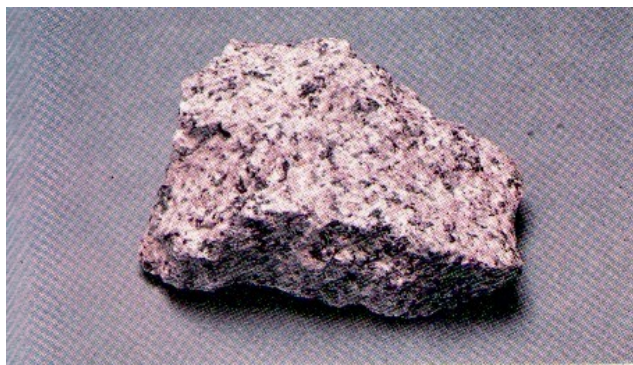
A – granite