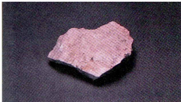
E – limestone