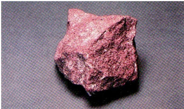
D – quartzite