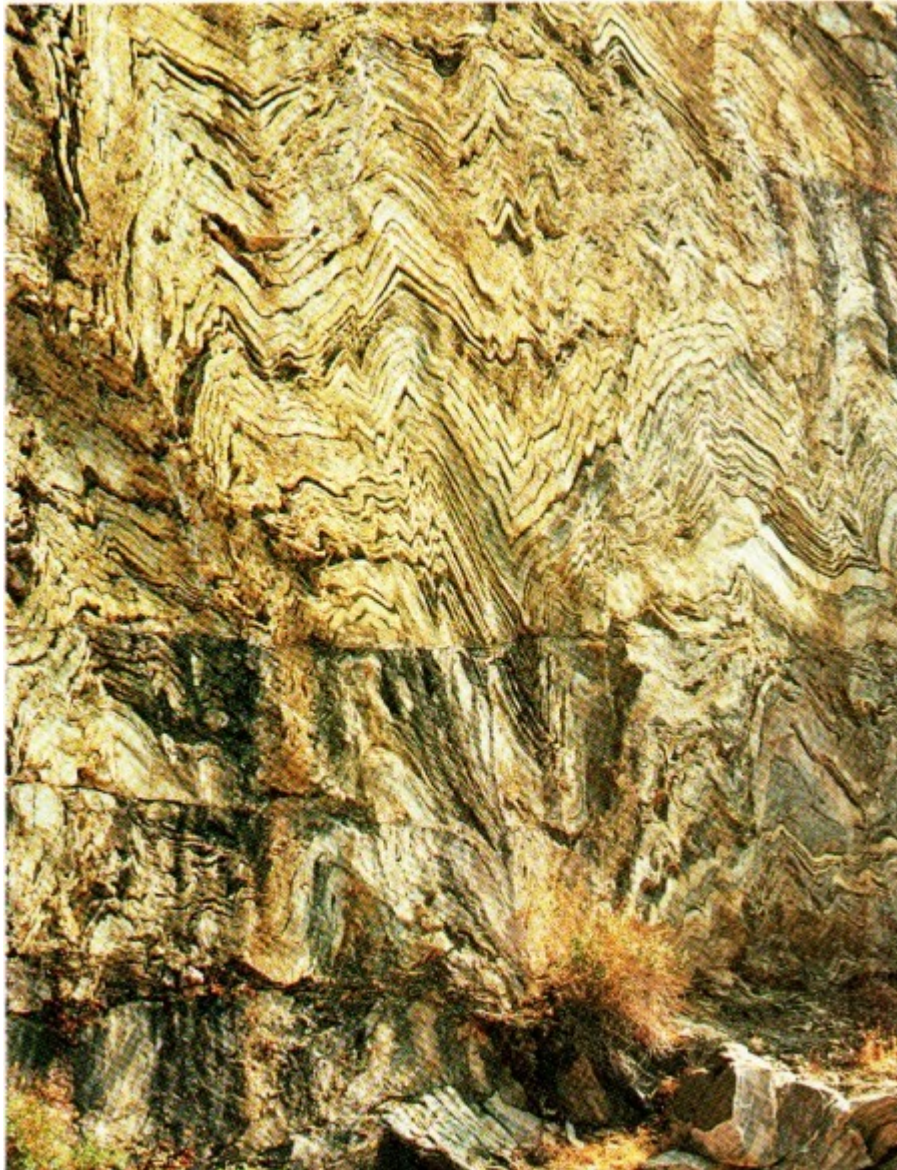
Figure 2-16, These layers of schist were photographed at King's Canyon National Park. What could have caused the bending and folding of the rock layers?