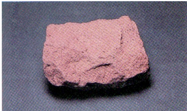
C – sandstone