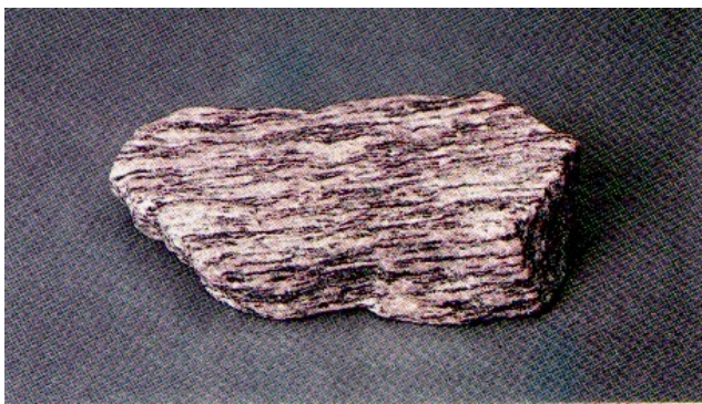
B – gneiss