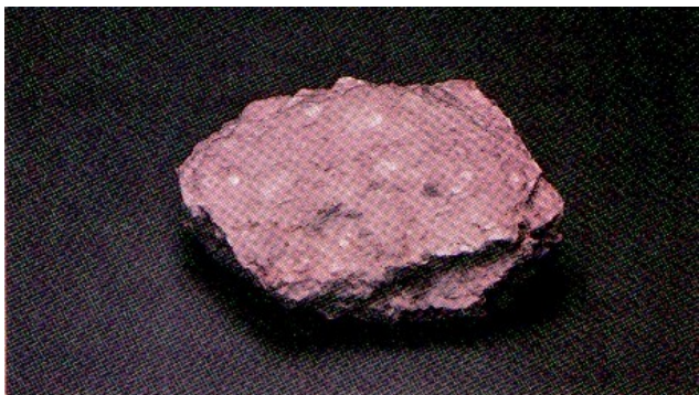
F – marble