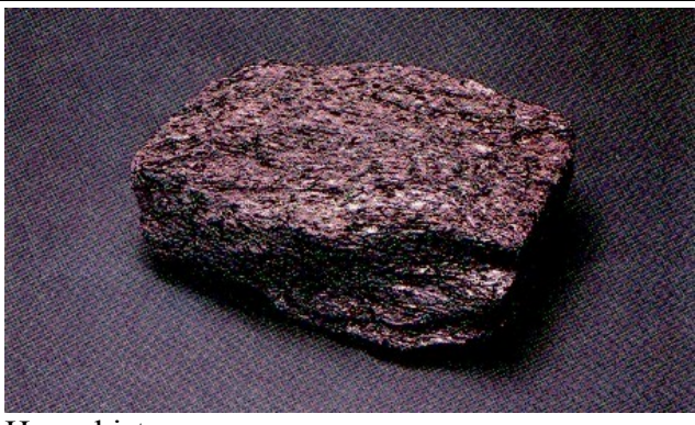
H – schist