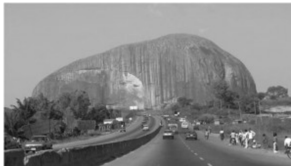
Aso Rock on the outskirts of Abuja

http://www.africatravelblogger.com/is-nigeria-the-king-of-africa/