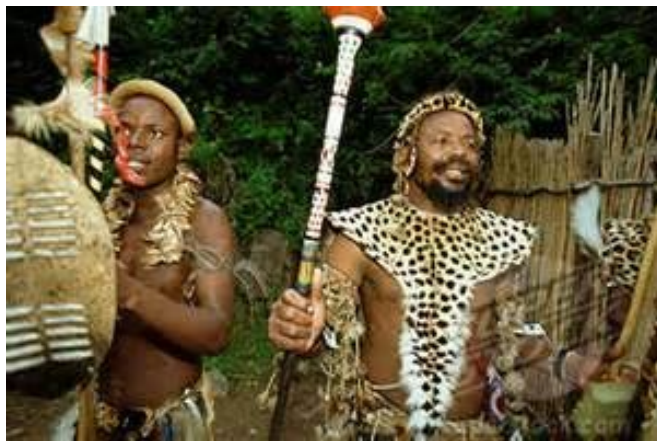
Simunaya village headman (S. Africa)