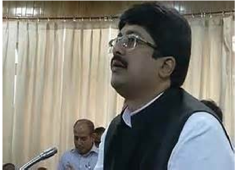
Village Headman in Uttar Pradesh