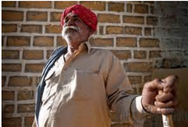
Village Headman in Rajasthan