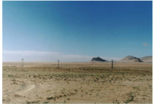
photo1: last reported breeding area at El Bayadh

MEININGER reported 4 birds in Boughzoul (LEDANT & al. 1981).