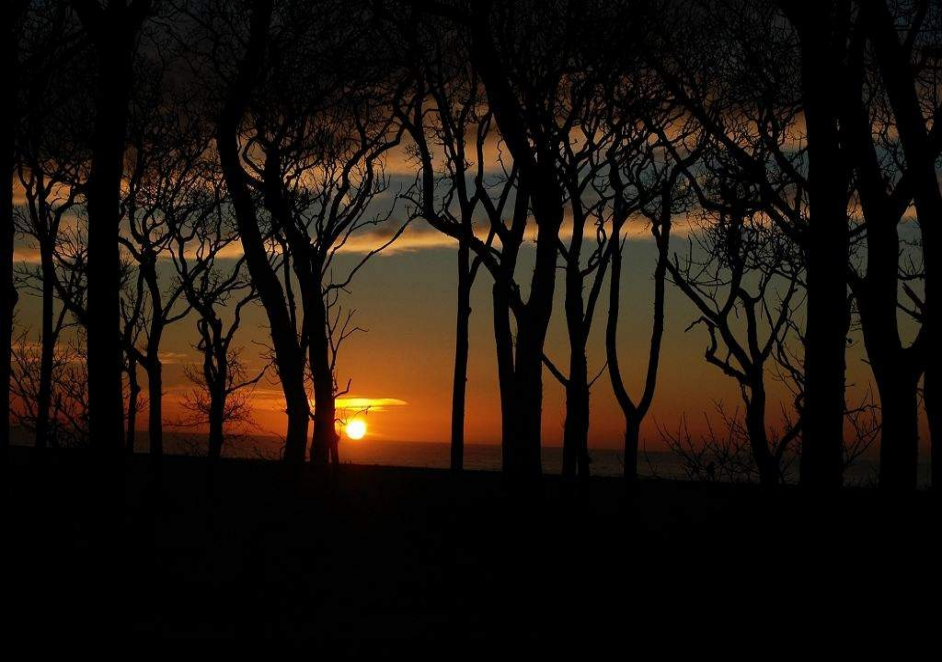
Sunrise in Timaru– shot in Organic farm