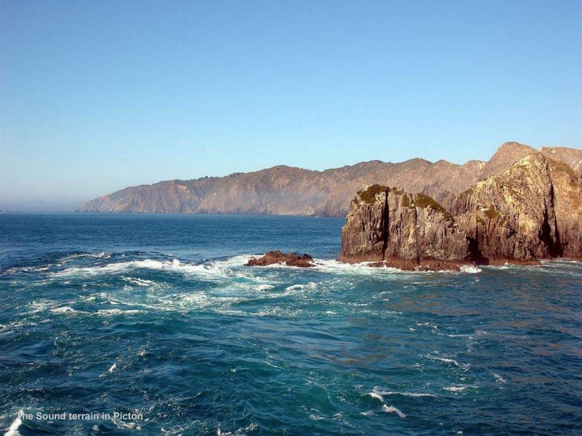
The Sound terrain in Picton