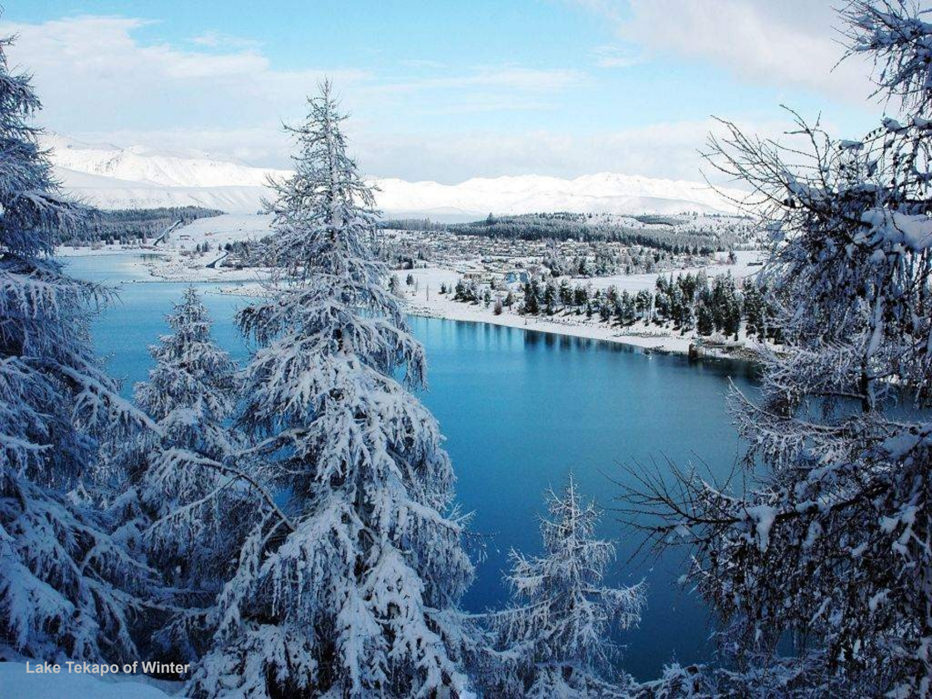
Lake Tekapo of Winter