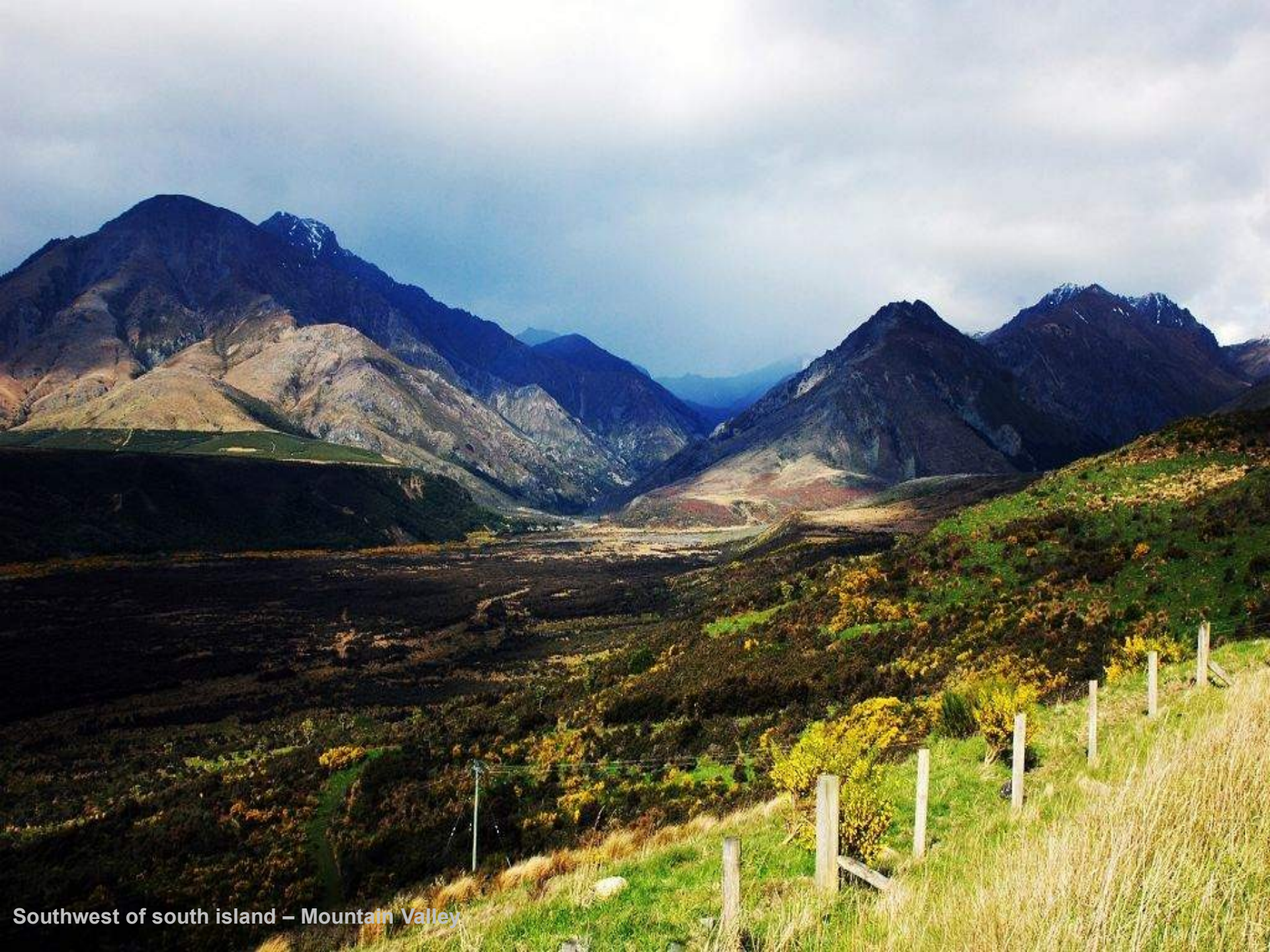
Southwest of south island – Mountain Valley