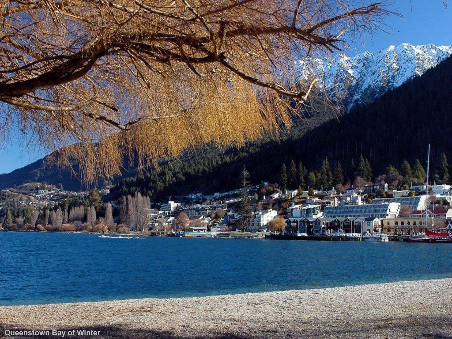
Queenstown Bay of Winter