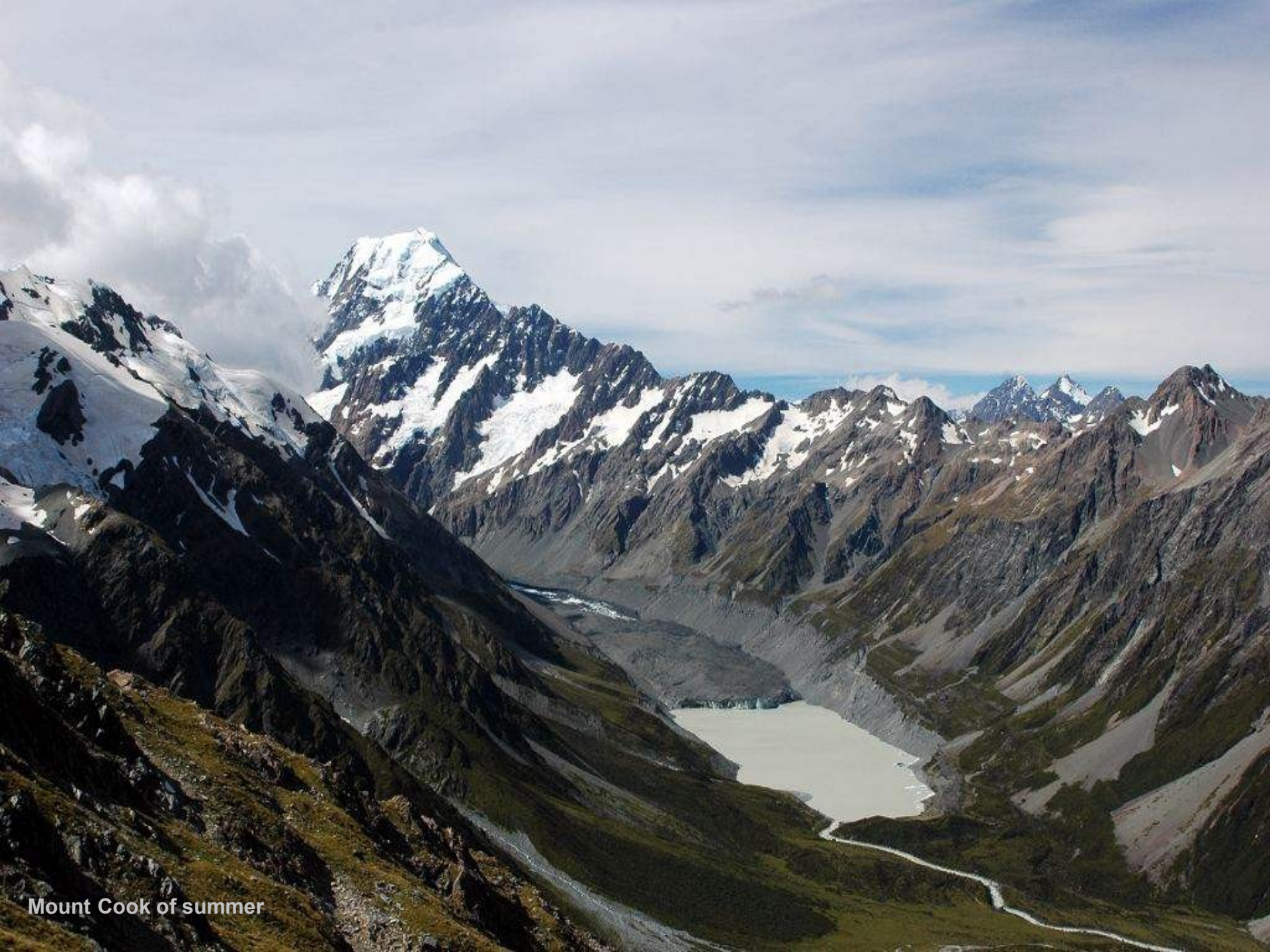
Mount Cook of summer