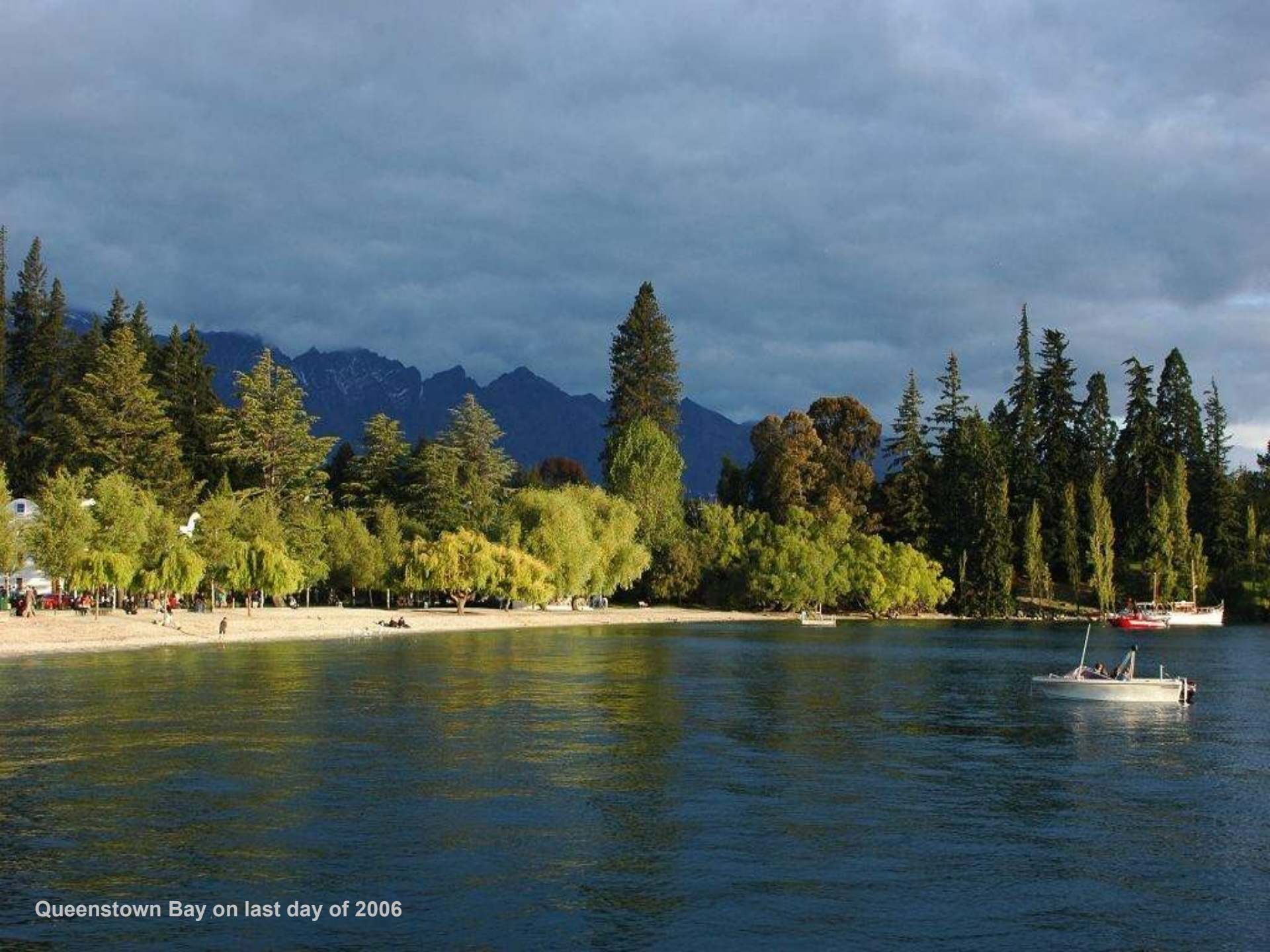
Queenstown Bay on last day of 2006