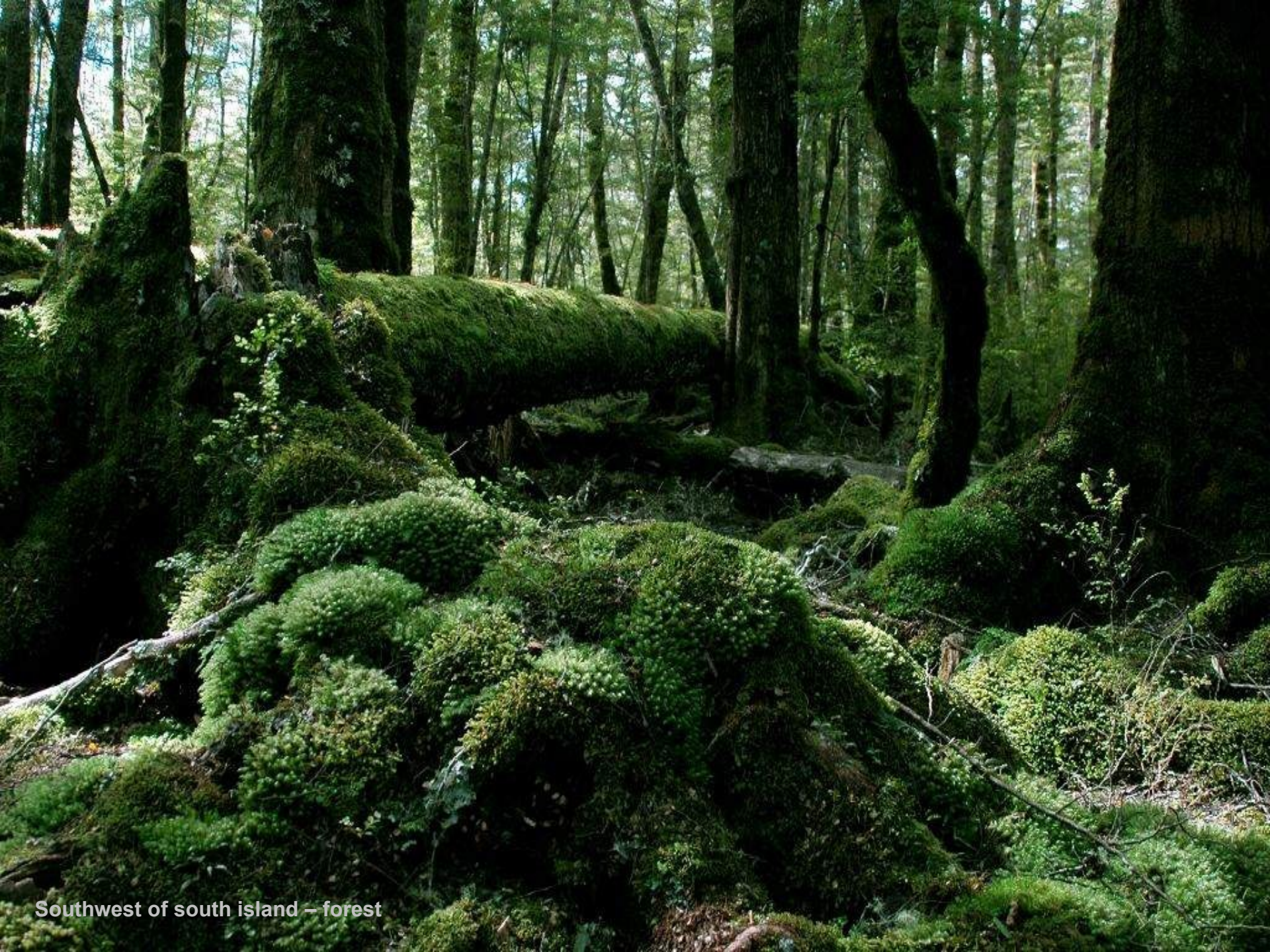
Southwest of south island – forest