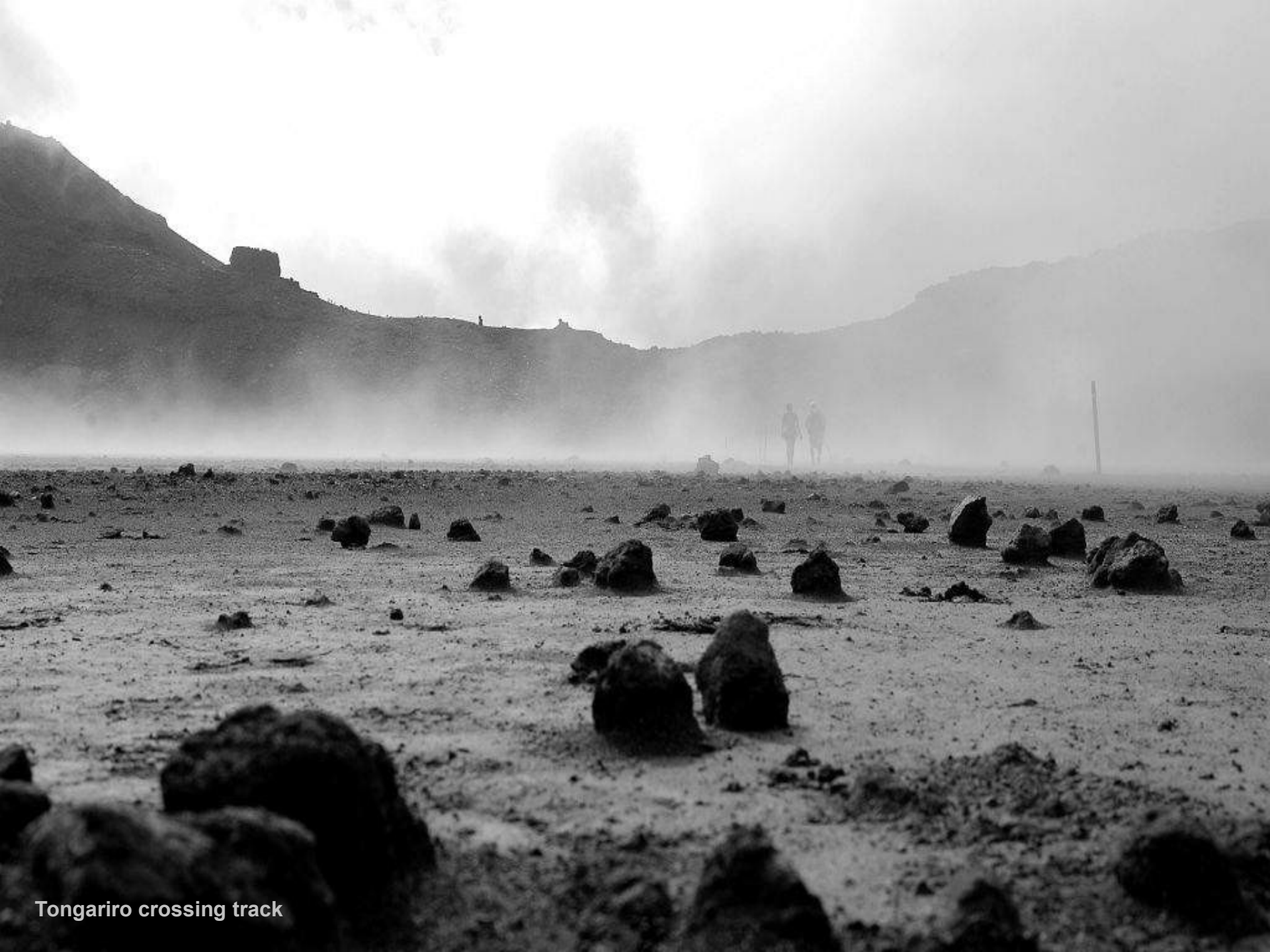
Tongariro crossing track