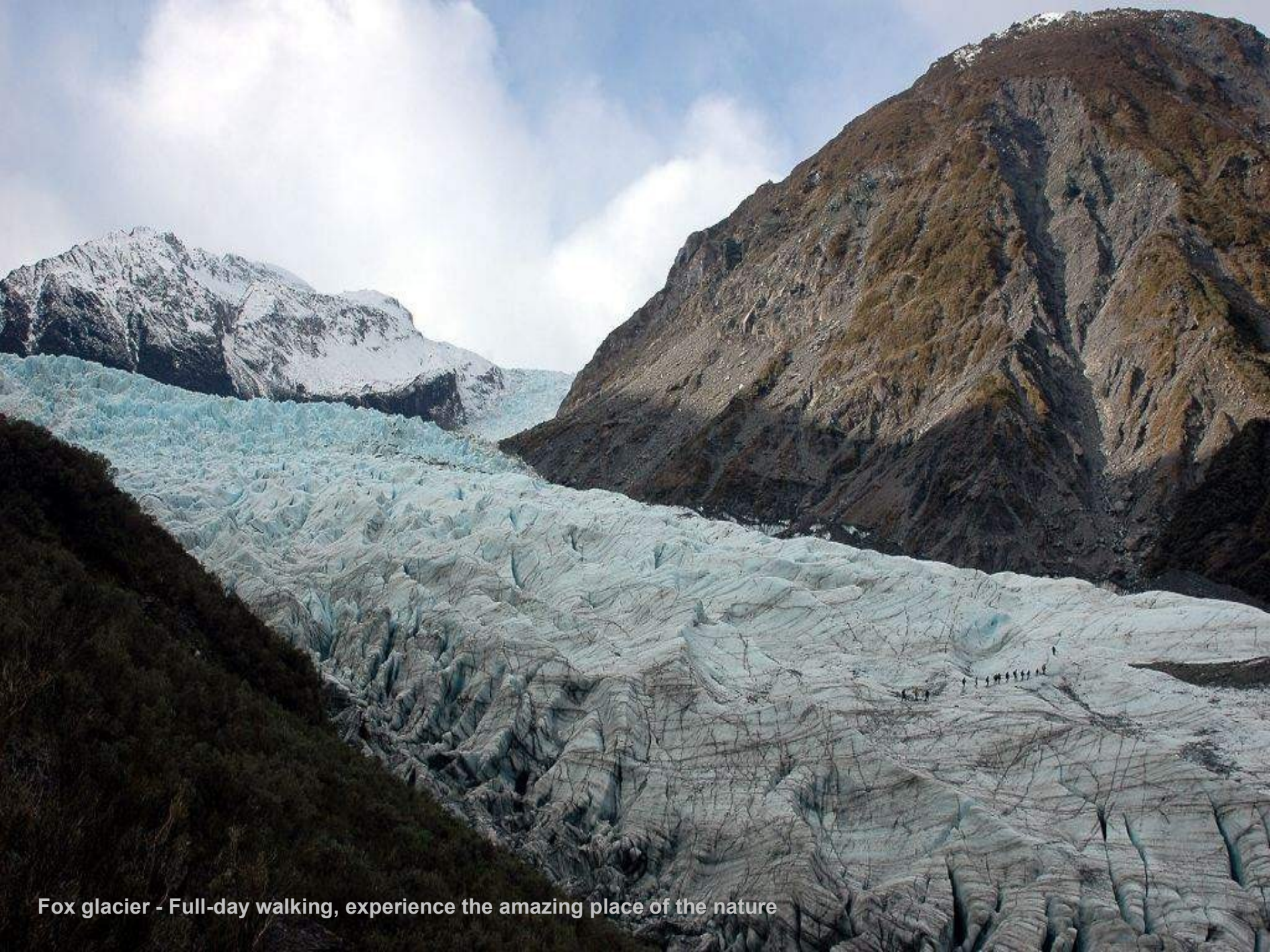
Fox glacier - Full-day walking, experience the amazing place of the nature