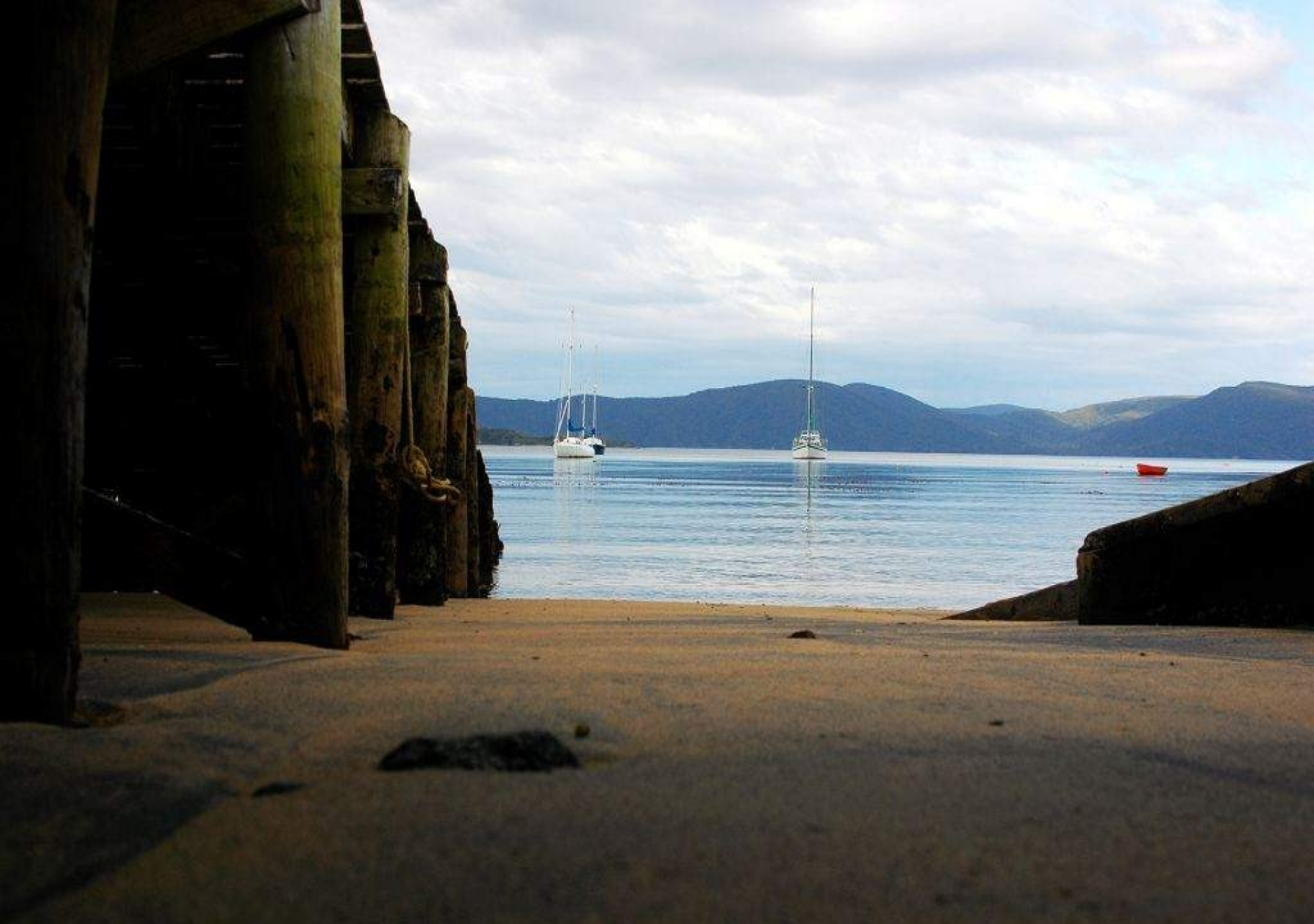
Stewart island - Watercress Bay