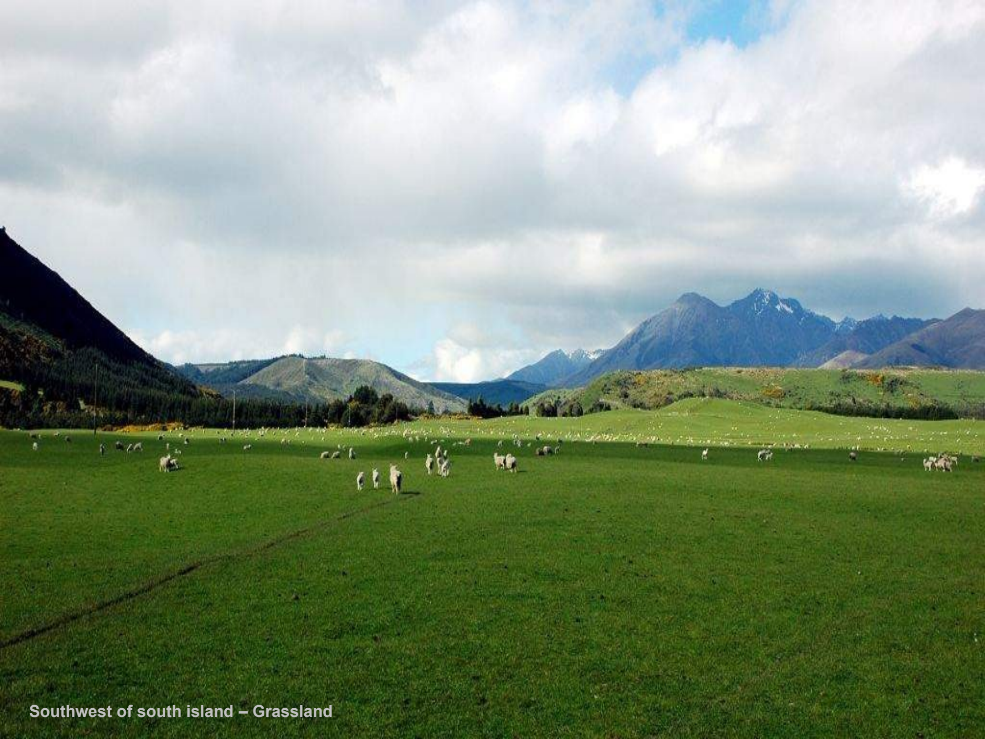
Southwest of south island – Grassland