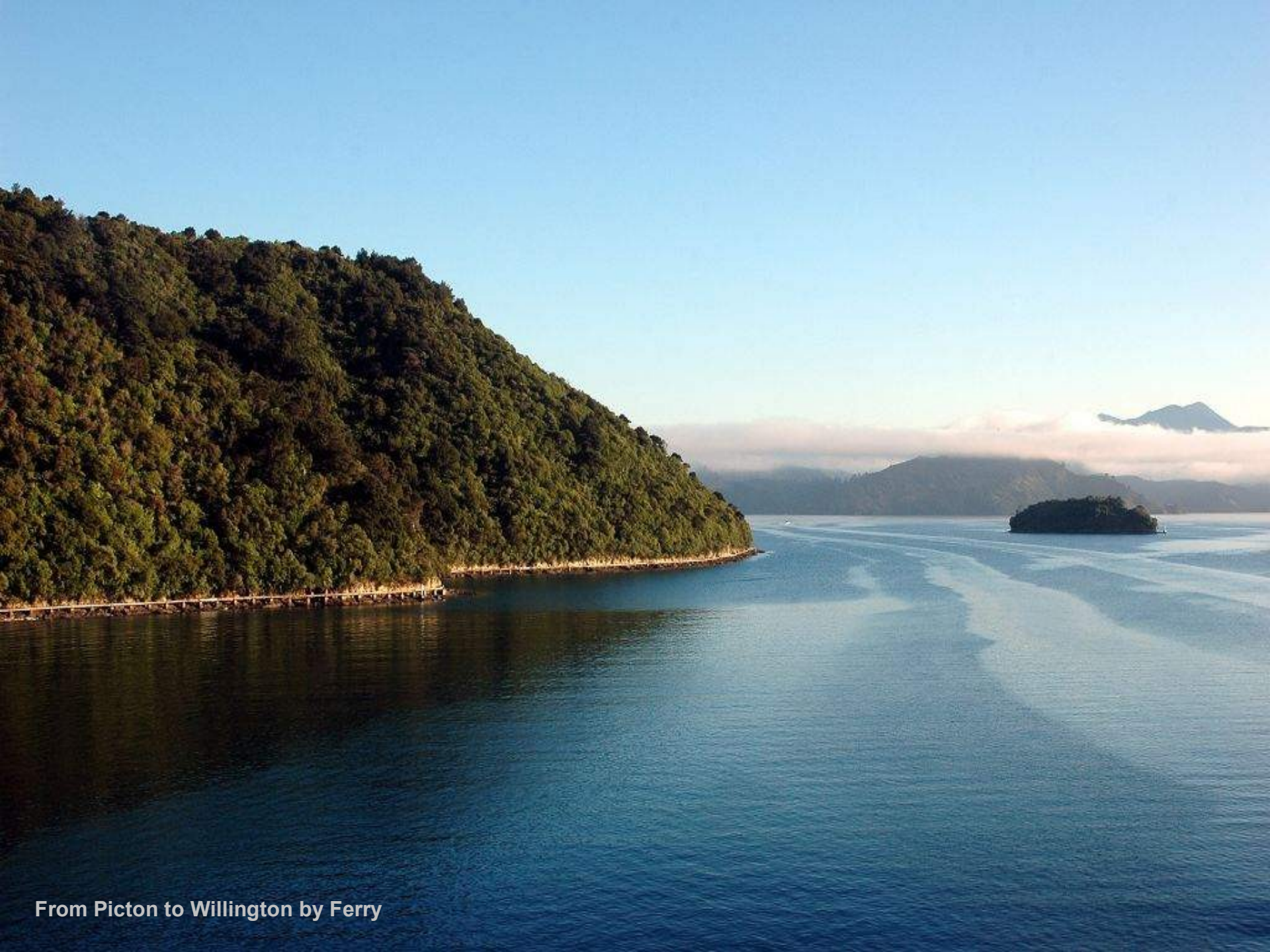
From Picton to Wellington by Ferry