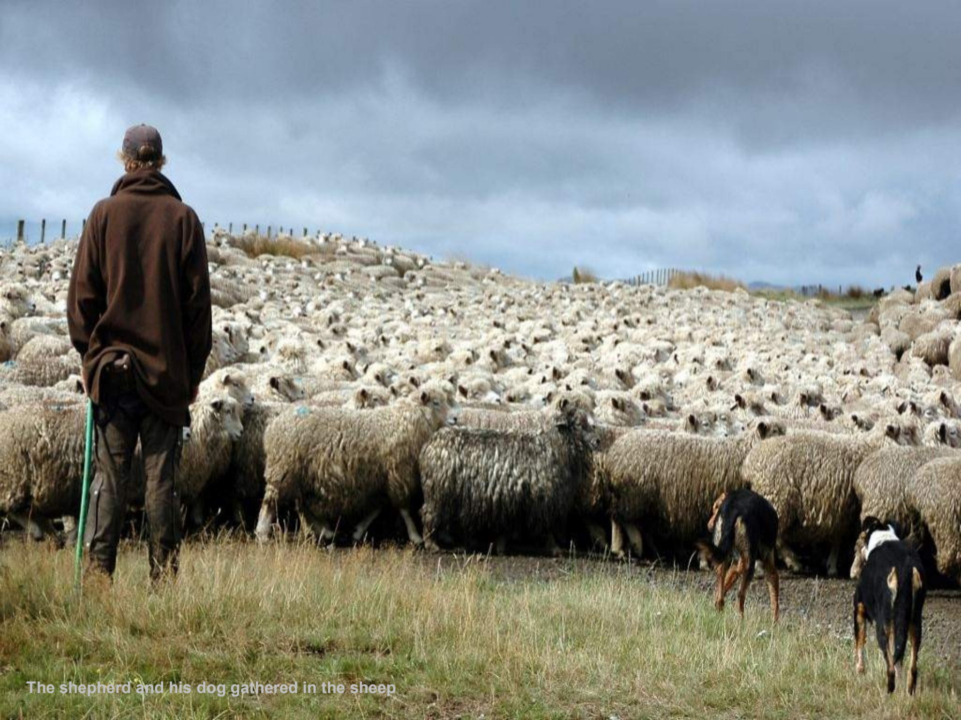
The shepherd and his dog gathered in the sheep