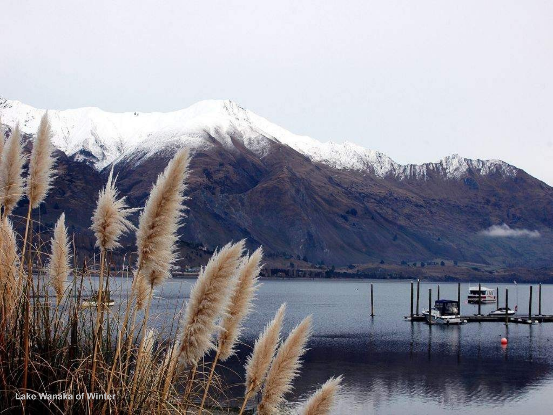
Lake Wanaka of Winter