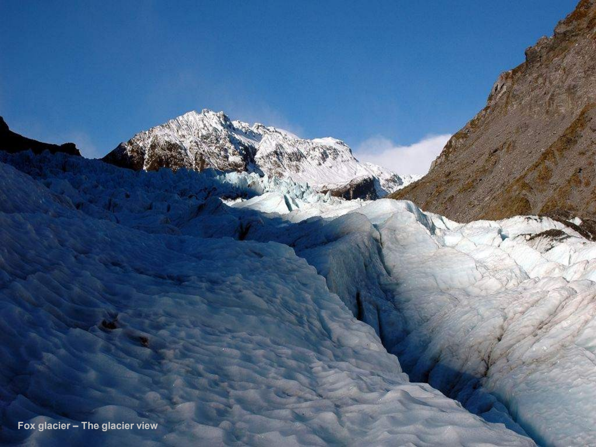
Fox glacier – The glacier view