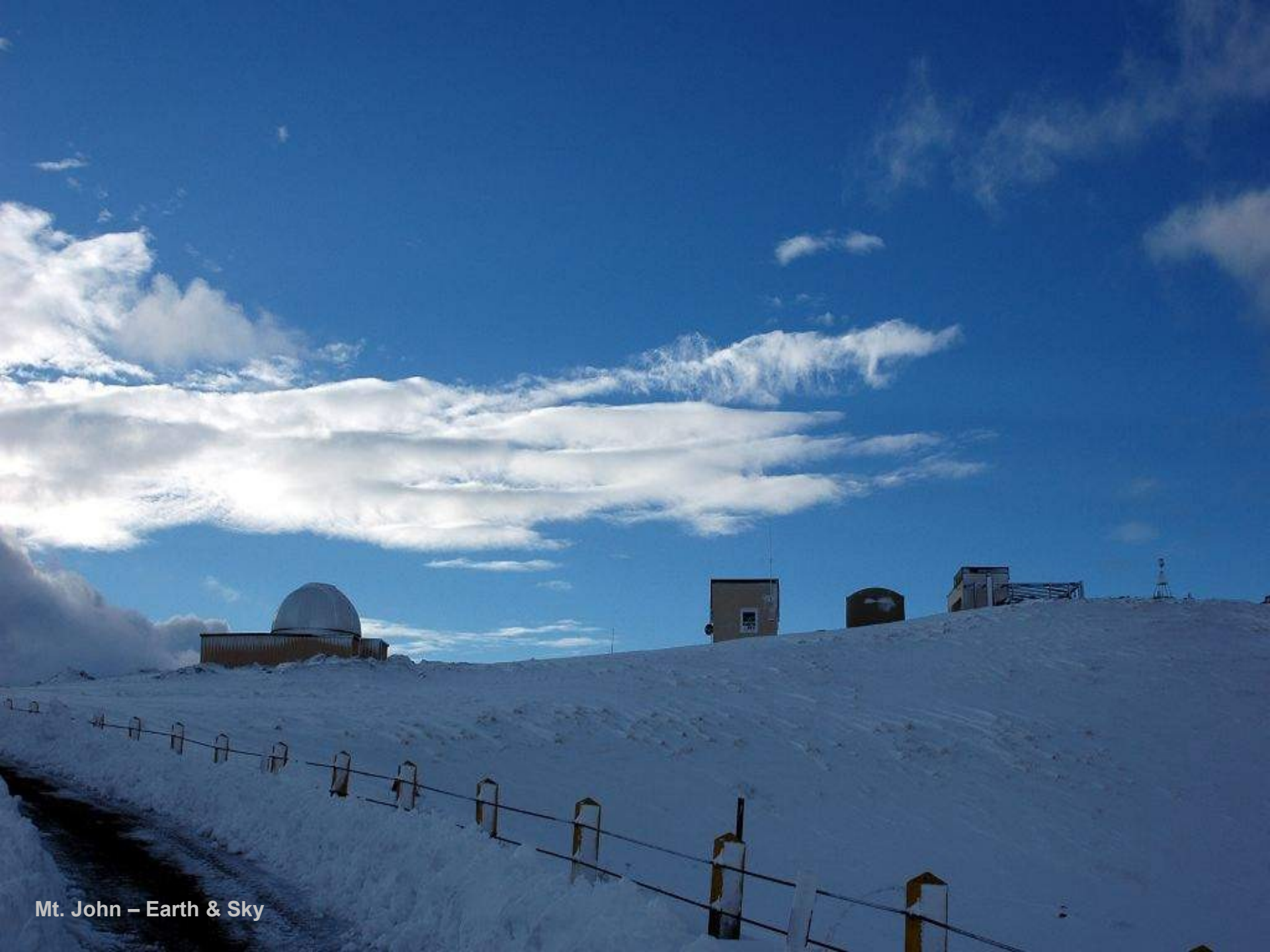
Mt. John – Earth & Sky