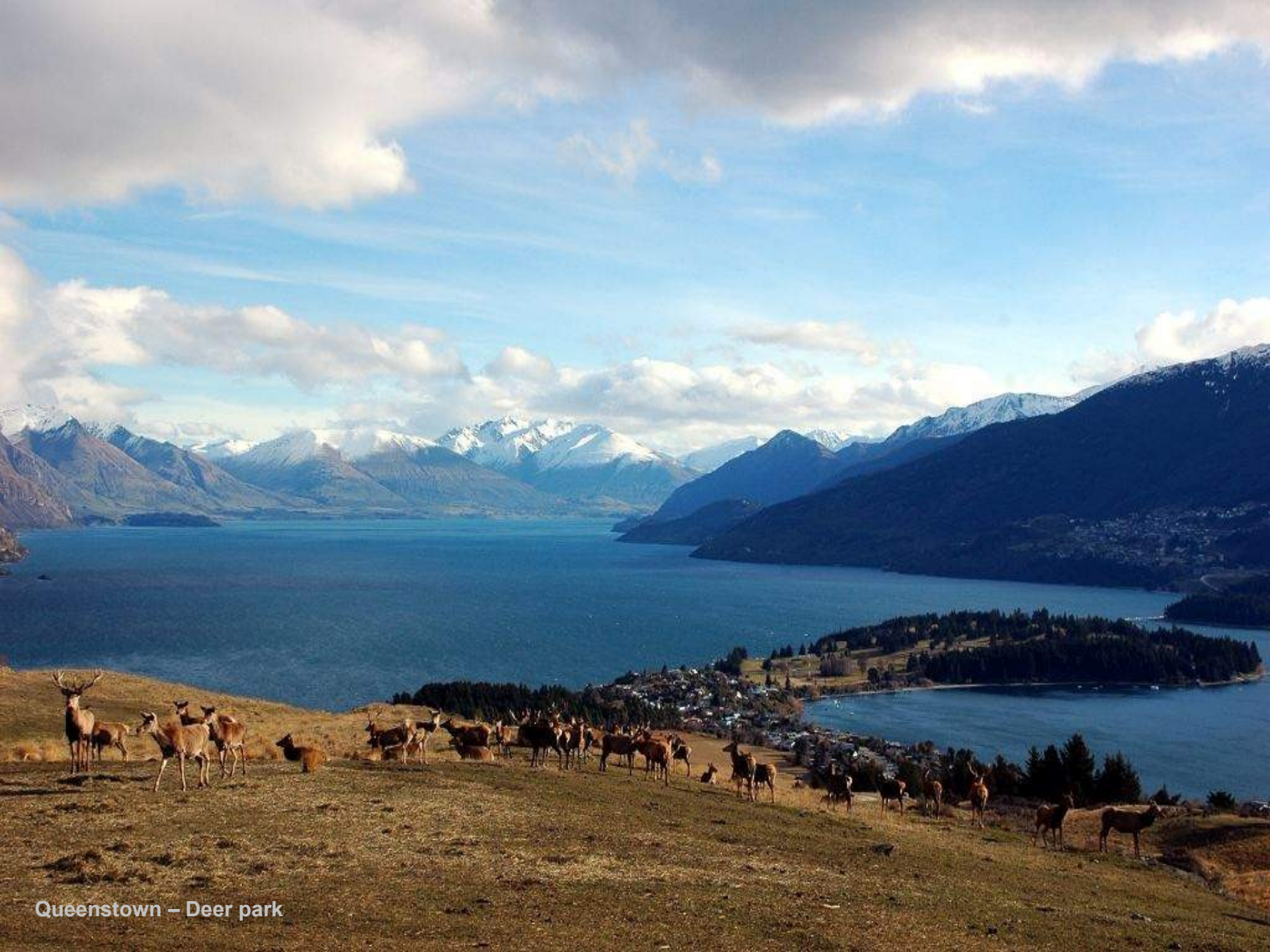
Queenstown – Deer park