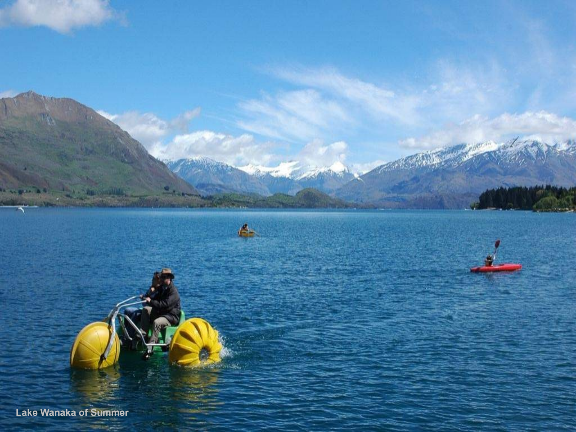
Lake Wanaka of Summer