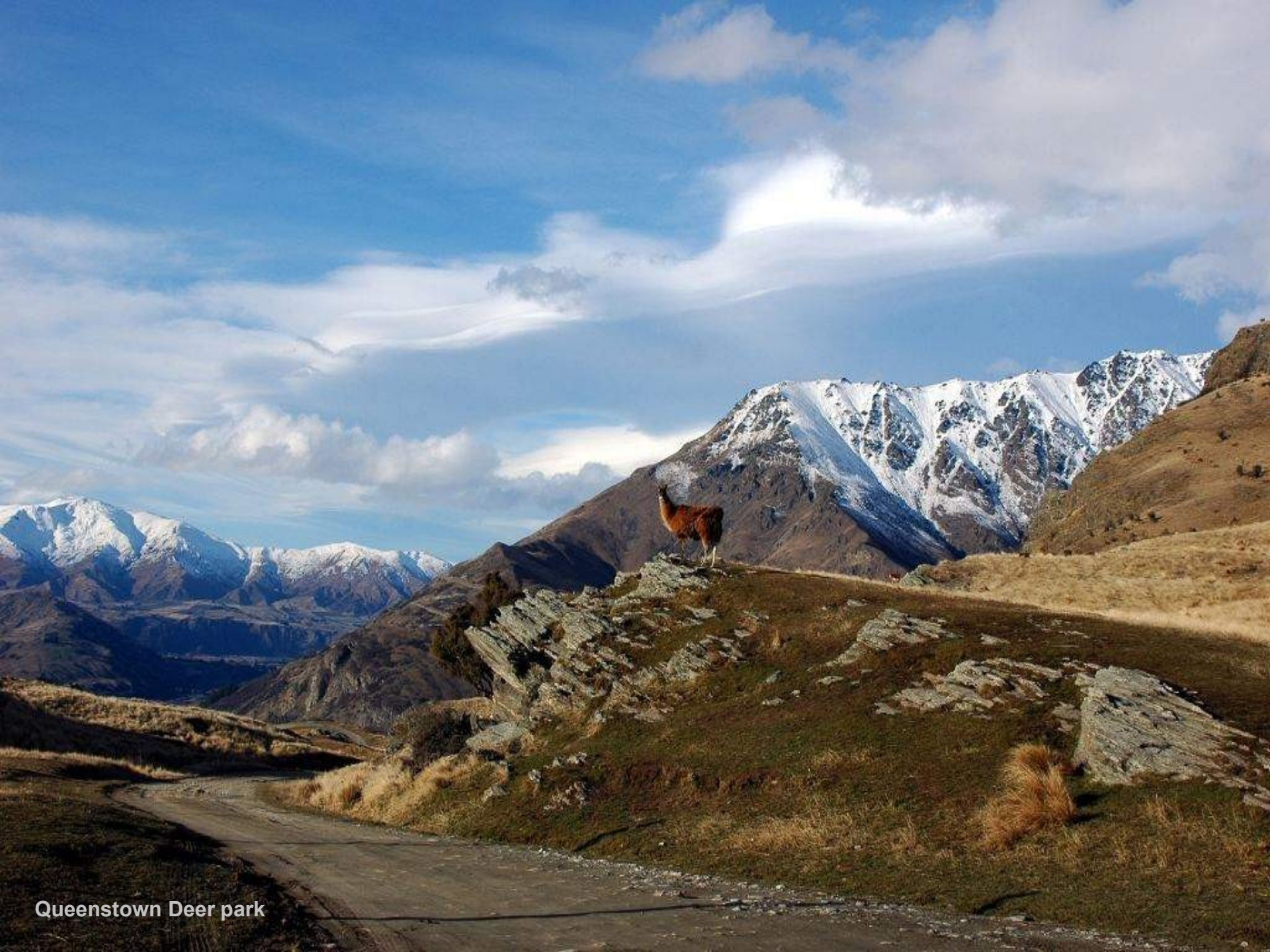
Queenstown Deer park