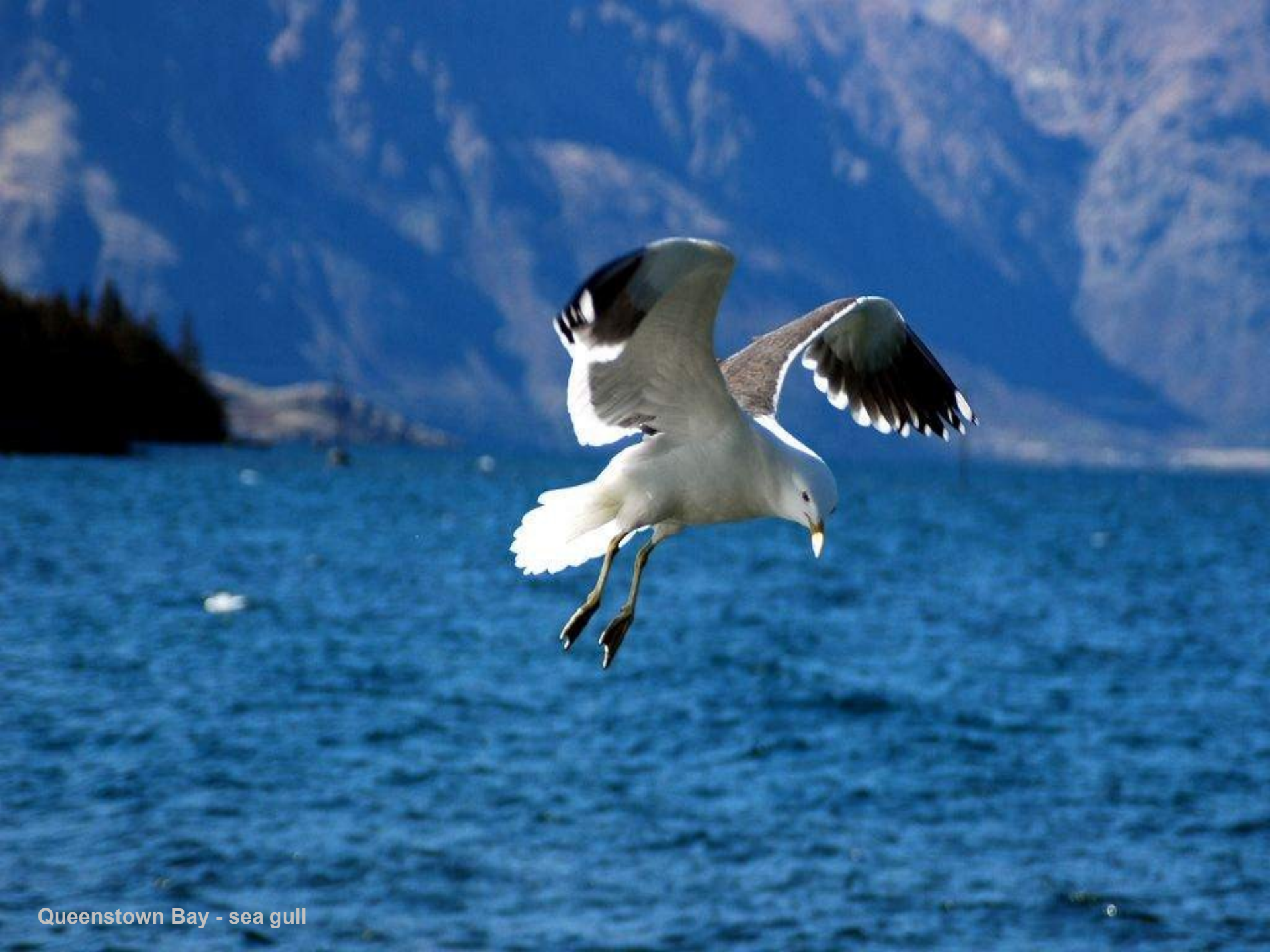
Queenstown Bay - sea gull