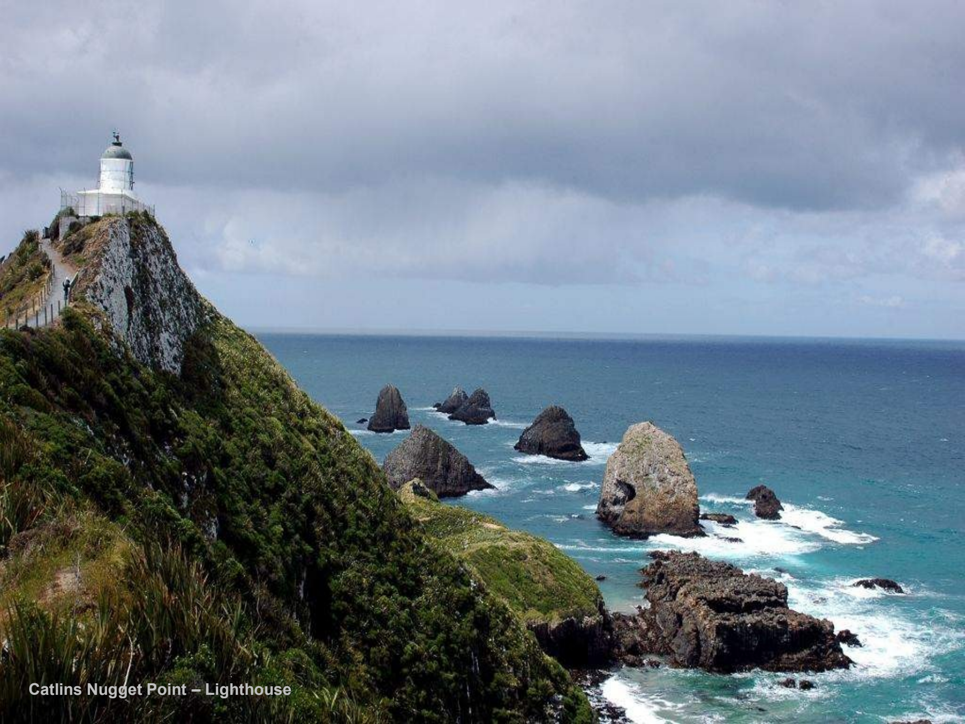
Catlins Nugget Point – Lighthouse