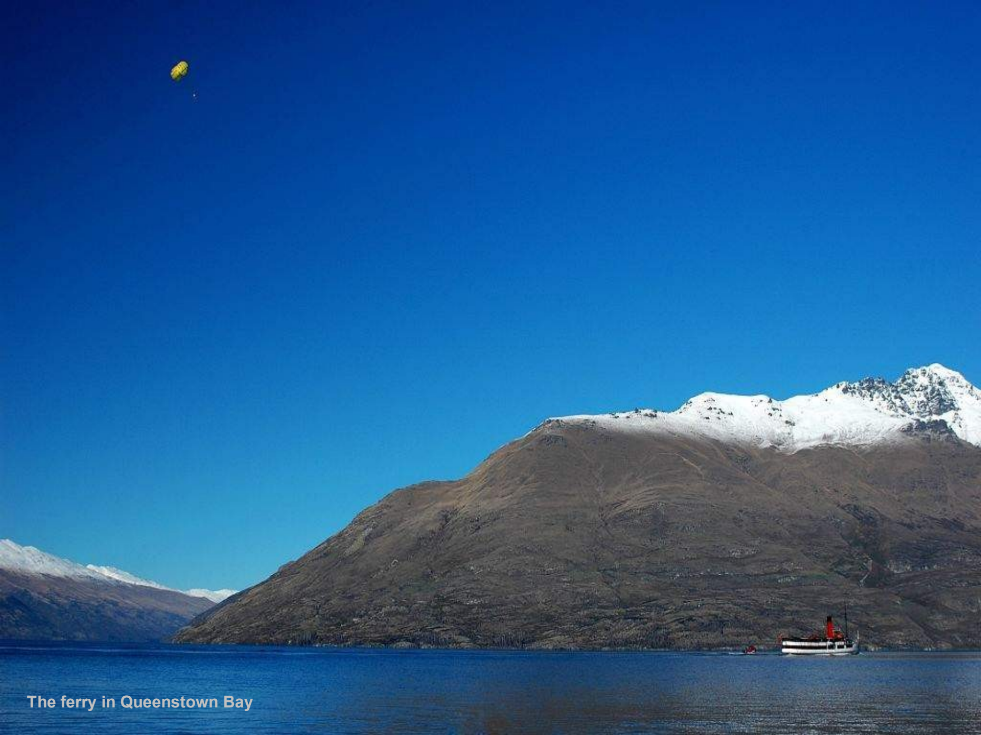
The ferry in Queenstown Bay