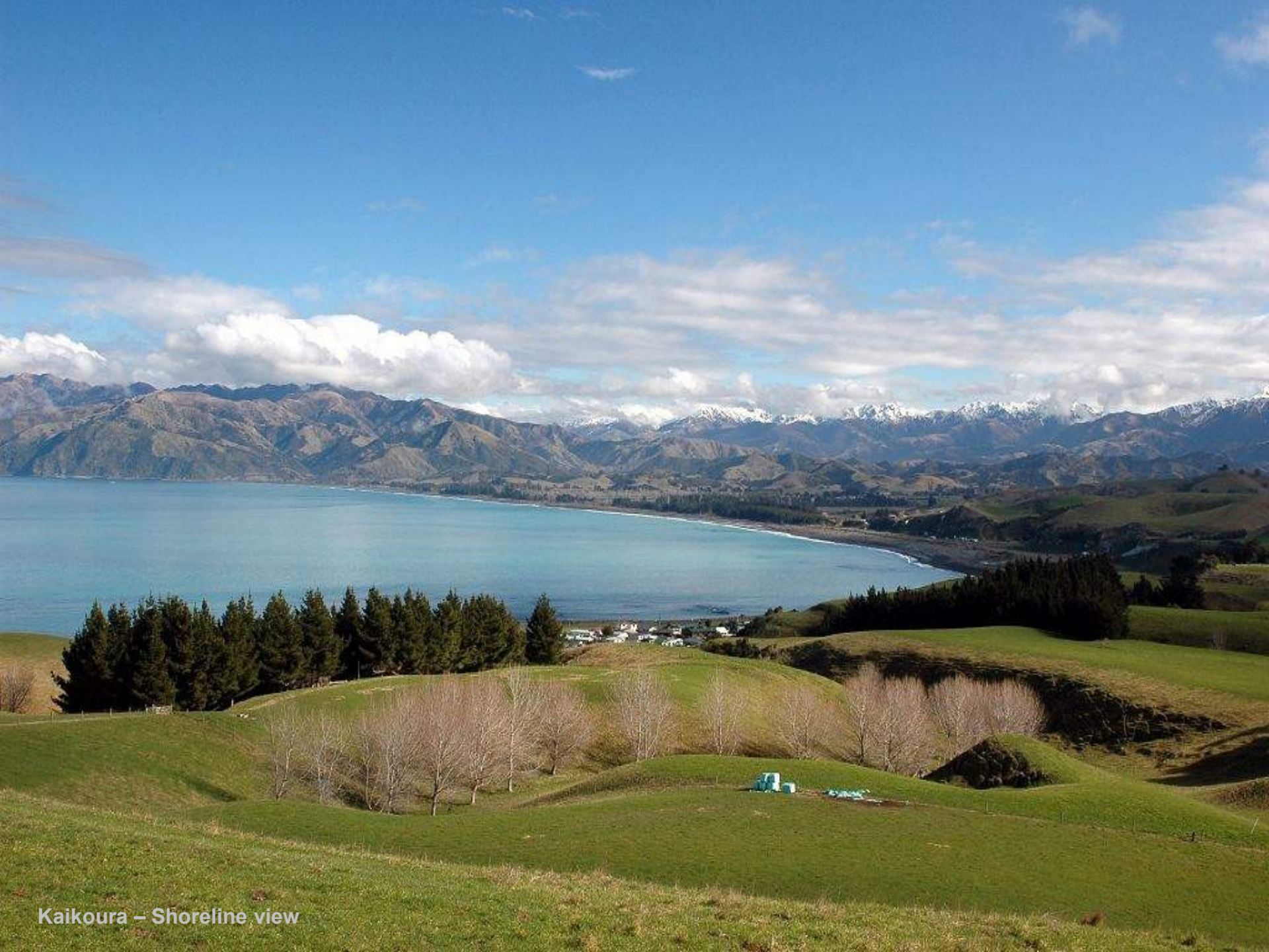
Kaikoura – Shoreline view