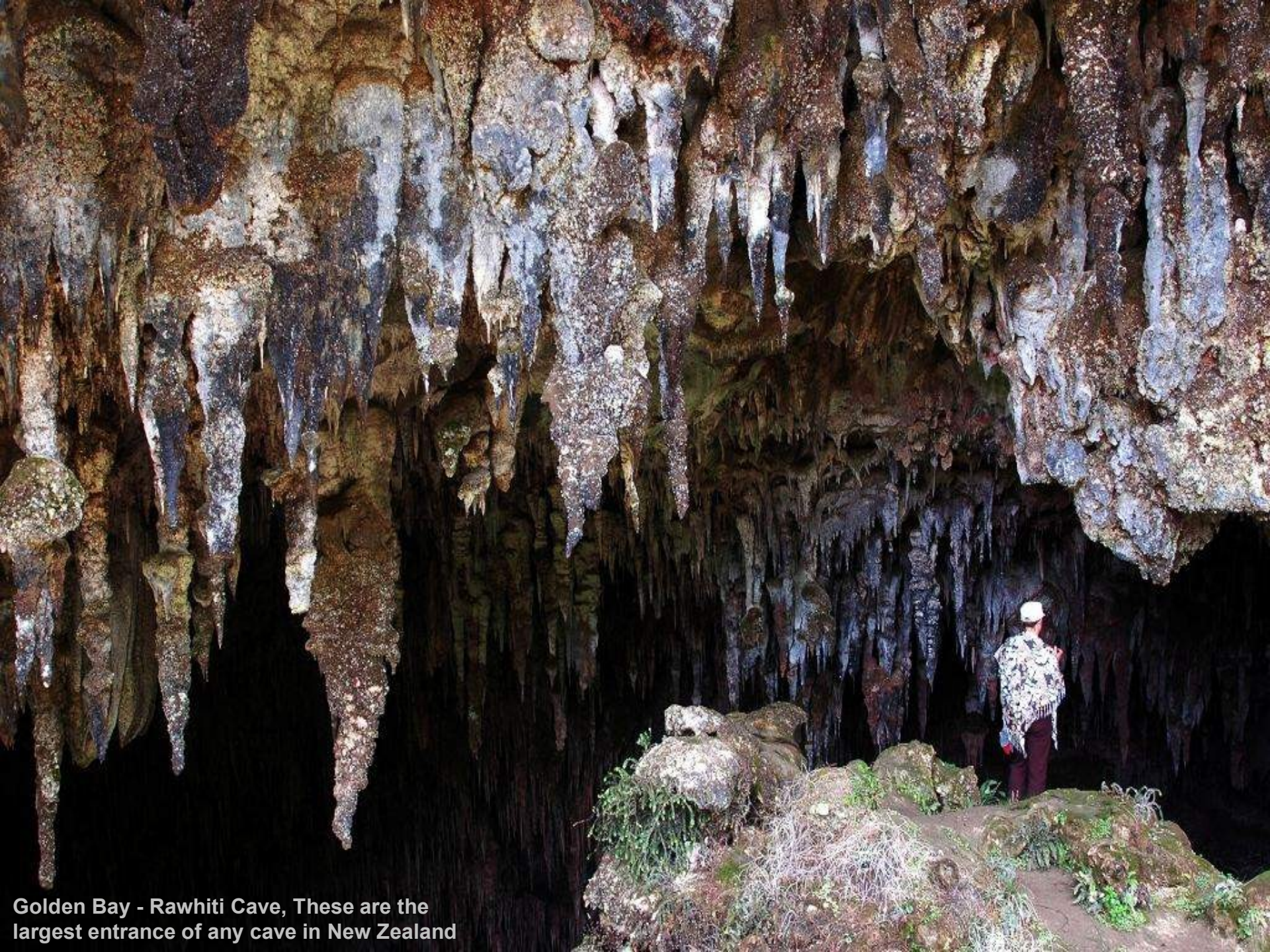
Golden Bay - Rawhiti Cave, These are the largest entrance of any cave in New Zealand