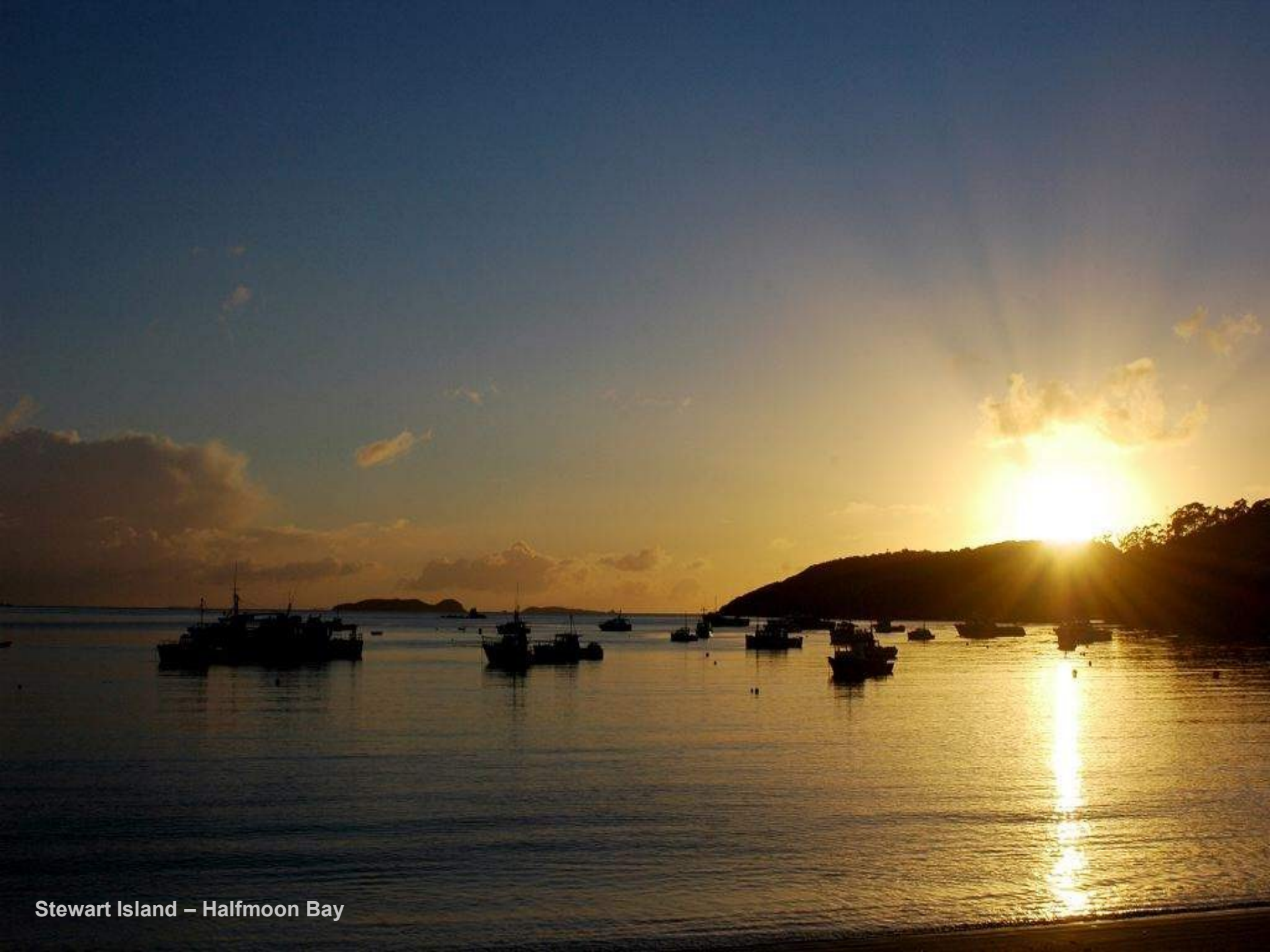
Stewart Island – Halfmoon Bay