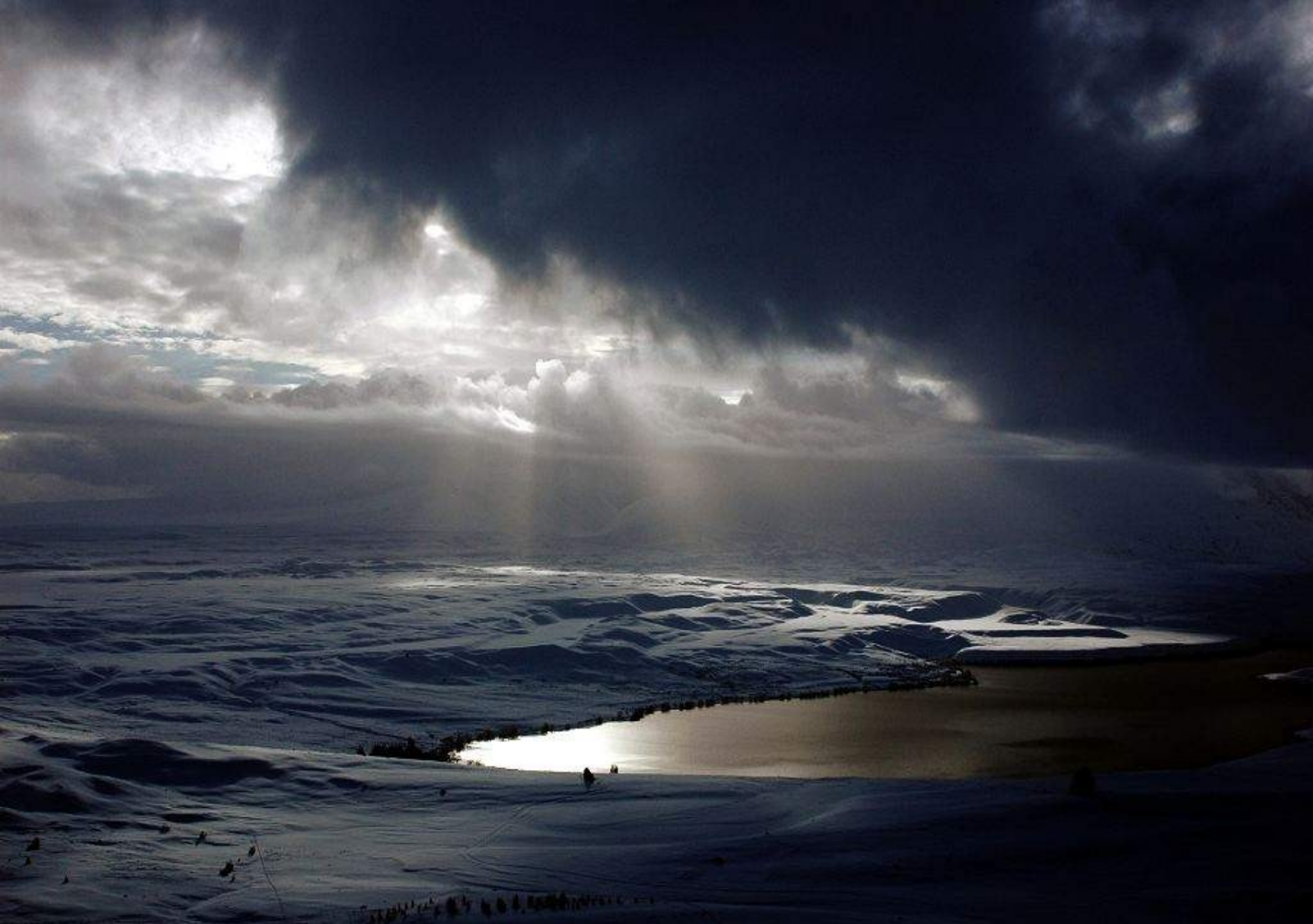
Mt. John - The weather was cloudy at the time, but as I saw the sun scattered on land that was covered with snow I thought this beautiful sight is the best present for me.