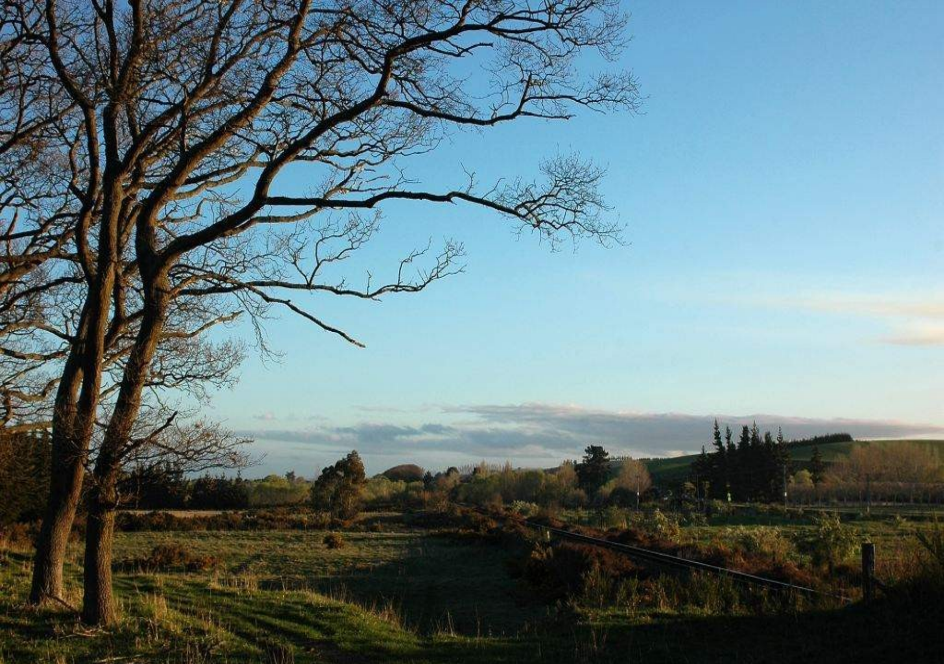
Timaru of Spring – shot in Organic farm