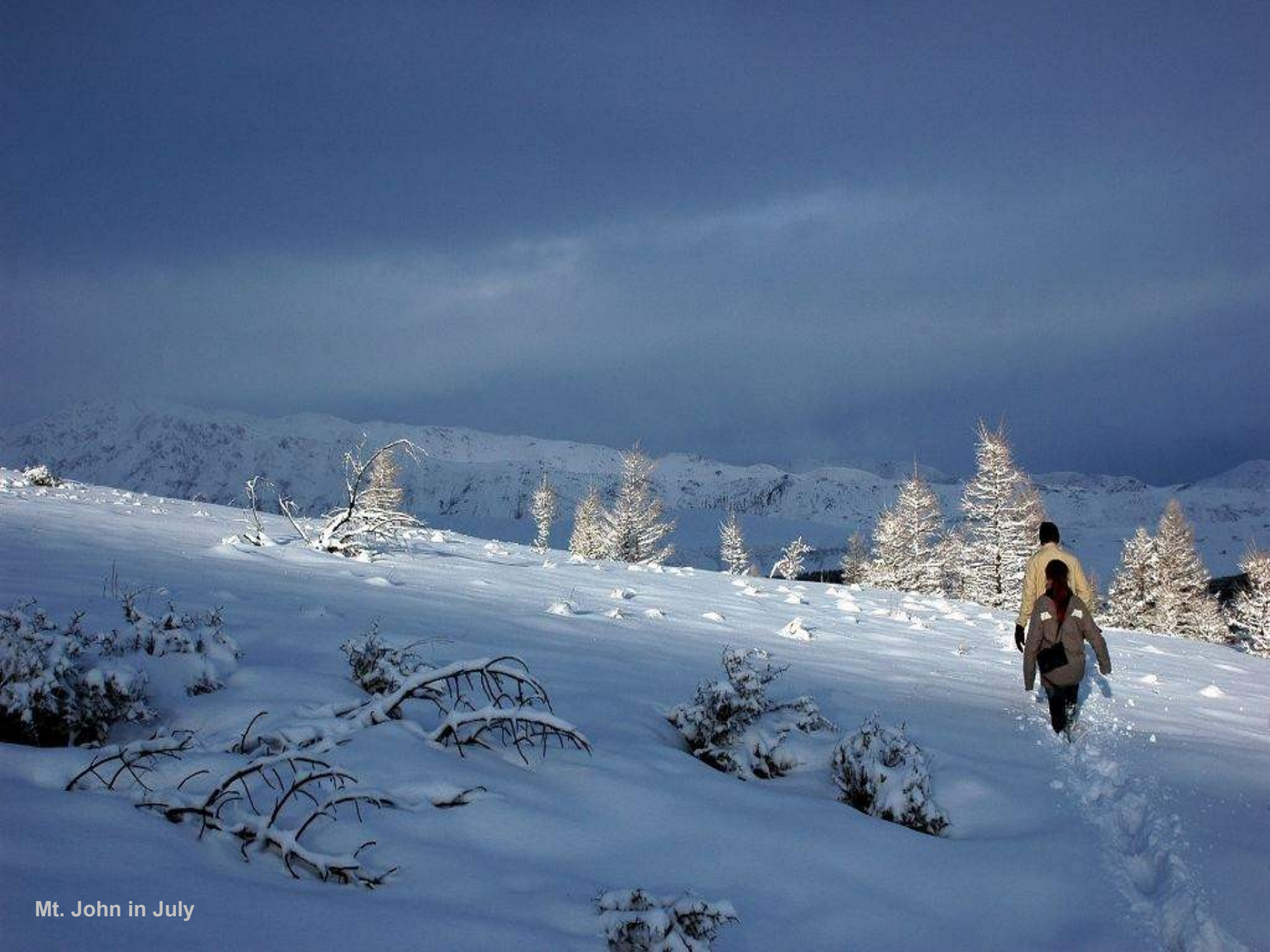
Mt. John in July