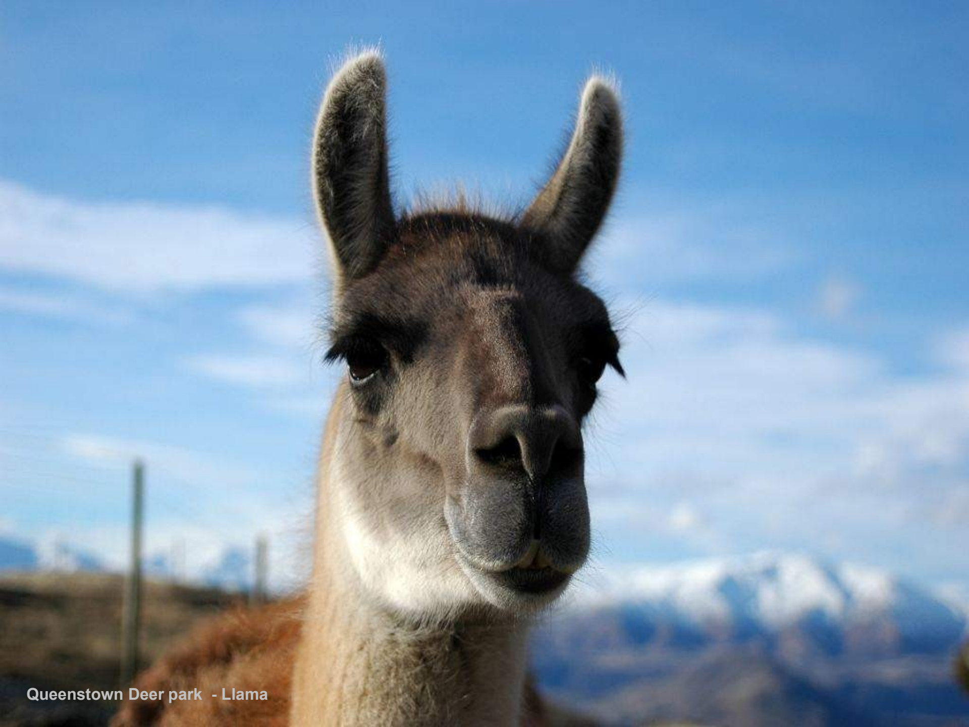
Queenstown Deer park - Llama