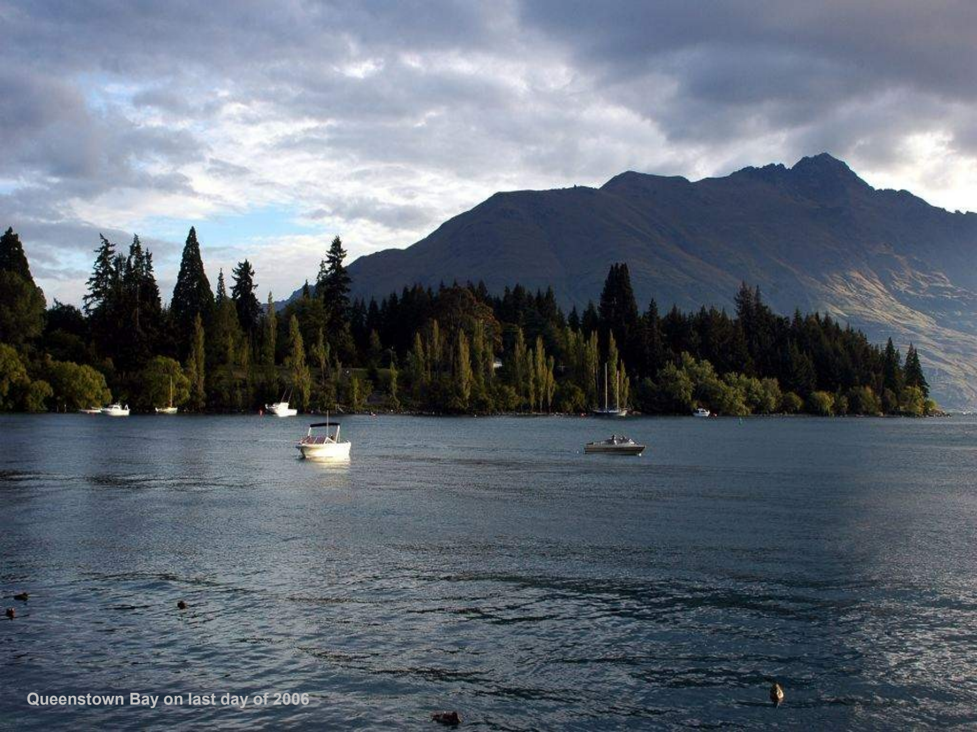
Queenstown Bay on last day of 2006