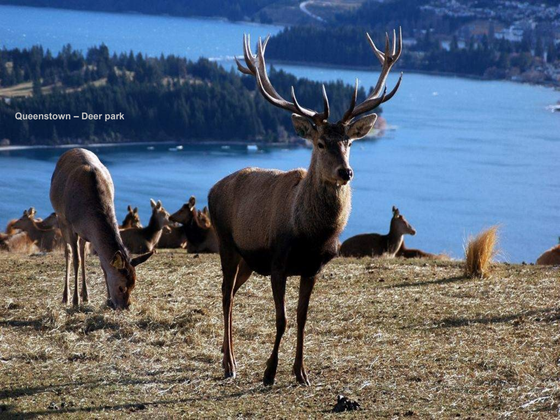
Queenstown – Deer park