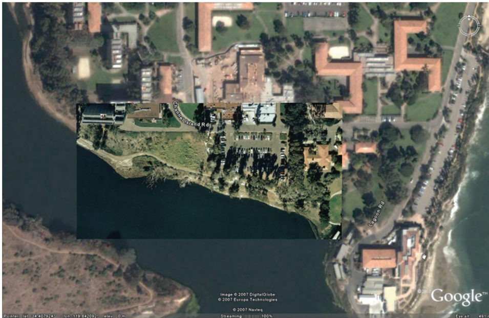
Figure 3. Google Earth mashup of a high-resolution image of part of the campus of the University of California, Santa Barbara, illustrating the inferred misregistration of the Google Earth base imagery.

Google base that is most substantially misregistered. However, a 15m shift is quite acceptable for many of the purposes for which Google Earth was designed.