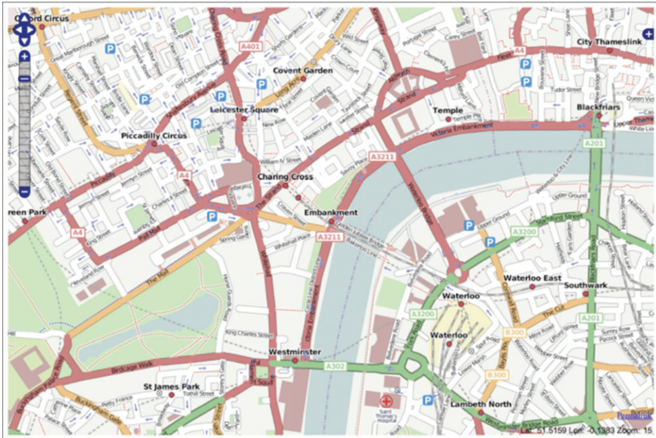
Figure 2. OpenStreetMap coverage of Central London, produced largely by the efforts of volunteers.

of what can be achieved by NeoGeographers in an arena previously dominated by large, expensive central mapping agencies such as the Ordnance Survey of Great Britain.