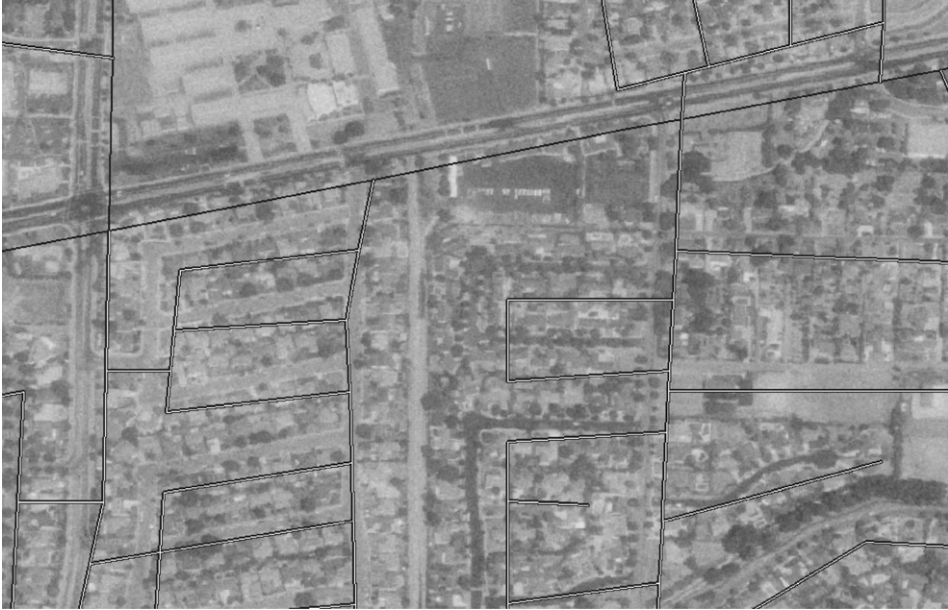
Figure 4. Misregistration of digital orthoimagery and roads in the US Geological Survey's National Map service.

little understanding of the details of the production process and little interest in the published metadata. Instead data are taken at face value, particularly when they concern phenomena that are part of everyday experience. Nevertheless one way to establish authority would be for novel sources such as OpenStreetMap to publish extensive documentation of the procedures used and to initiate programs of quality testing.