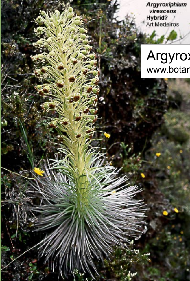
Argyroxiphium virescens