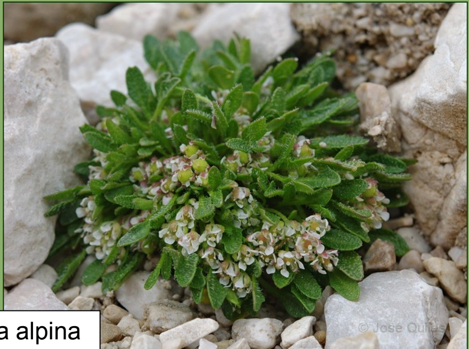
Rhizobotrya alpina www.florasilvestre.es