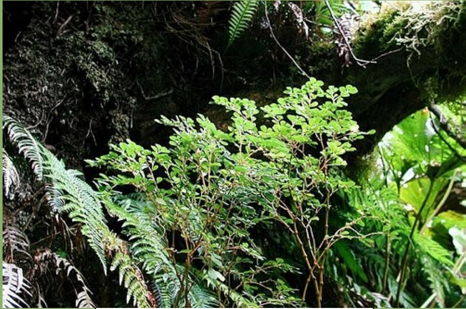
Lactoris fernandeziana