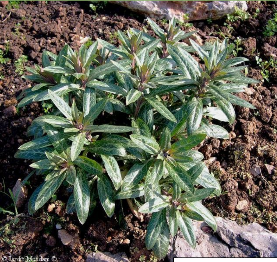
Lysimachia minoricensis