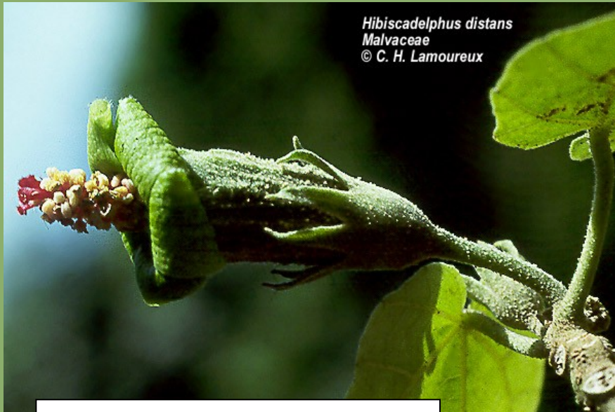
Hibiscadelphus distans Malvaceae