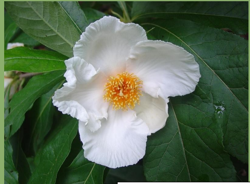
Franklinia alatahama