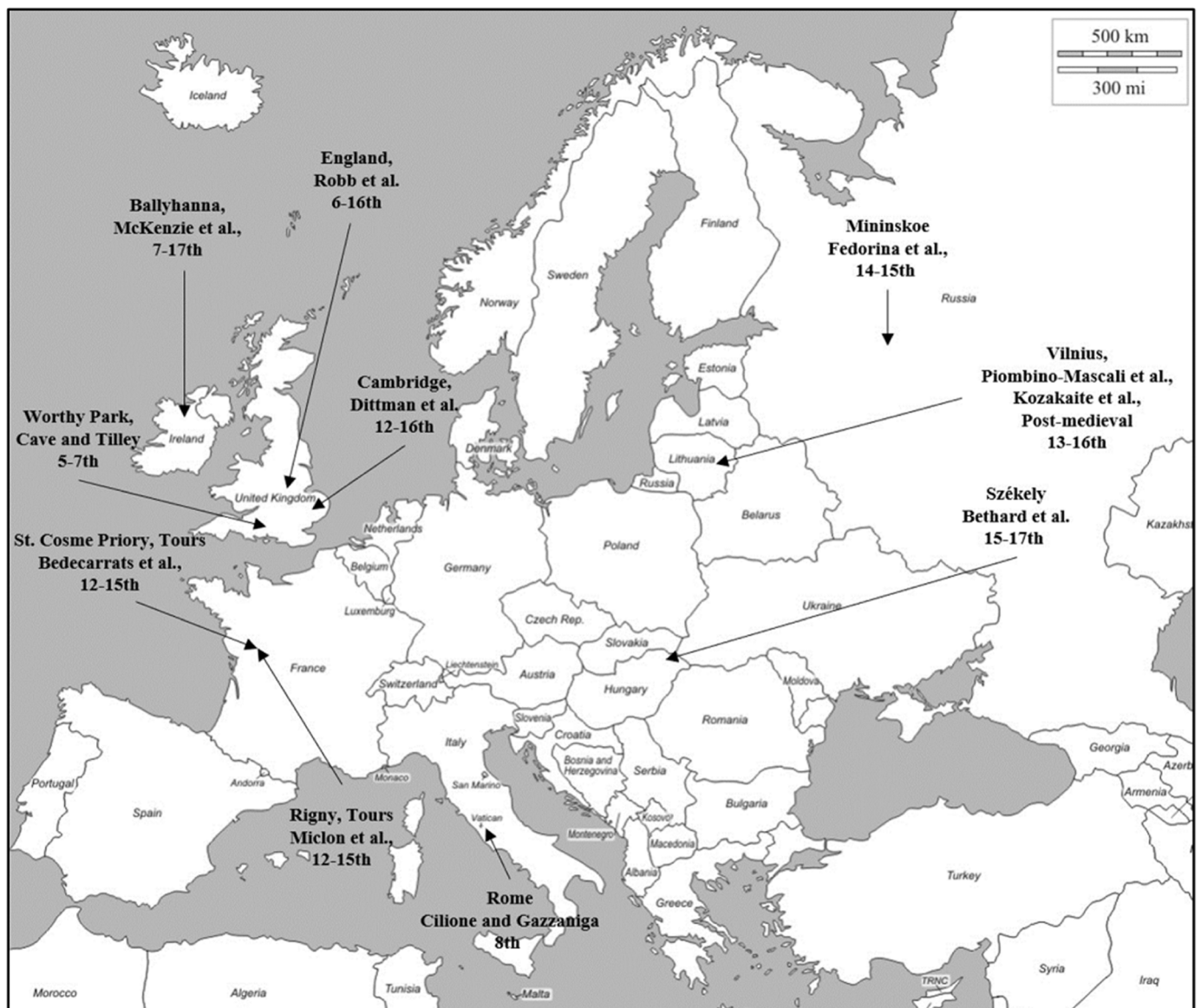
Fig. 1. A geographical and chronological map of the Special Issue papers. As a conceptual paper, Knüsel (2021) is not present in this map.

The 12 papers in this Special Issue, eight based on conference presentations and four invited contributions, explore the biological and social consequences of disease in the Medieval past at the individual and/or population levels and across diverse geographic, social and chronological lifeways (see Figs. 1 and 2). More specifically, two papers are situated in the Early Medieval period (450–1000 CE); two in the High Middle Ages (1000–1250/1300 CE); three analyse materials dated between the High and Late Middle Ages (1000–1500 CE); two are located in the Late Middle Ages (1250/1300–1500 CE); and one extends into the Early Modern period. One paper covers a topic spanning pre-history, as well as the Middle Ages: the identification of ‘healers’ in the archaeological record. Geographically, some of these studies are situated in territories which were once part of the Roman Empire (Italy, France, and Great Britain), and others in countries outside the Empire’s direct sphere of cultural influence (Lithuania, Russia, and Ireland); in a larger sample of studies it would be interesting to examine whether any significant differences in care strategies existed between these two groups. Many of the papers combine several disciplines, including historical archaeology, human biology, paleopathology, and history of